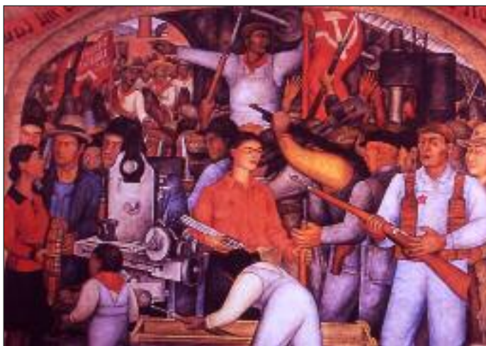
Fresco painted by Diego Rivera in 1928 “Distribution of Arms”

Soldiers, as part of the working class, must understand that the solution is not to blindly obey the bosses' orders but to build communist consciousness and unite with their class brothers and sisters to destroy this system and build a communist system, where the priority will be the well-being and security of the whole working class.