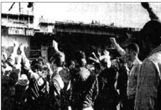
Off the USS Constellation, 1972

The House Armed Services Committee summed up the crisis of rebellion in the Navy: “Recent instances of sabotage, riot, willful disobedience of orders, and contempt for authority ...are clear-cut symptoms of a dangerous deterioration of discipline.”