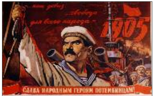
The Potemkin Mutiny

Without this bold decision to organize massively in the military, the upcoming revolution of 1917 would not have been successful.