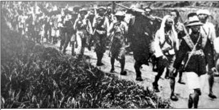
Chinese Red Army, 1930

was eventually crushed by the army and the revisionist (capitalist disguised as communist) CPC leadership including Mao.