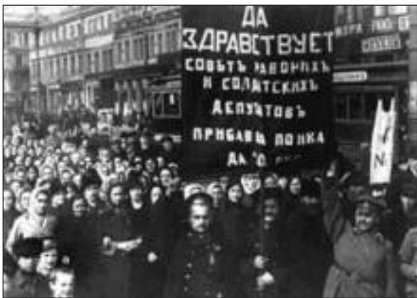
Workers' and Soldiers' Soviet St. Petersburg, 1917

By 1917, a Russian general estimated that there were 2 million deserters. Soldiers left the German front in WWI to join with workers and peasants to collectively make the 1917 Bolshevik Revolution a success, responding massively to the call to turn the imperialist war into a revolution for workers' rule. Within a year, the Red Army was created with the most class conscious and organized elements of the toiling class.