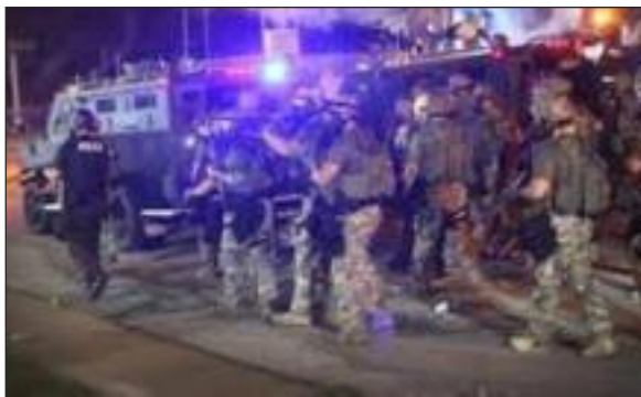
National Guard reinforces police during Ferguson protests over murder of unarmed black teenager Michael Brown. Guard troops should support the protests.

This is not a perfect world; there will always be problems, but we'll deal with them in a completely different way, based on working class collectivity rather than capitalist exploitation.