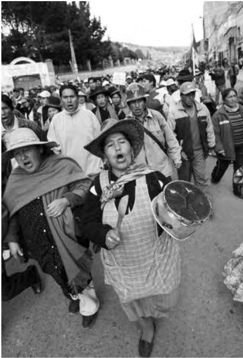
Workers in Bolivia protest Evo Morales' move to increase fuel prices by 82%--finding out the hard way that his "Movement Towards Socialism" is in fact a movement towards more oppressive capitalism.

NEWSPAPER OF THE INTERNATIONAL COMMUNIST WORKERS' PARTY * ICWPREDFLAG.ORG