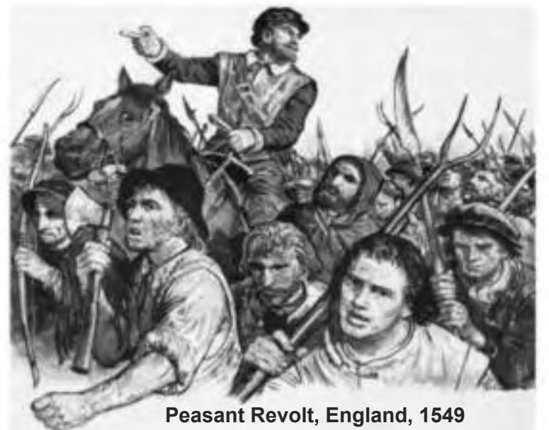
Peasant Revolt, England, 1549

We will create the ideological and material basis to totally eliminate classes and eradicate the exploiting classes' poisonous ideologies - racism, sexism, nationalism, religion, individualism, and cynicism - that they have used to enslave us.