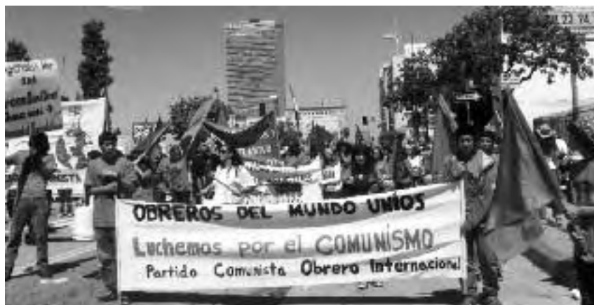
Los Angeles--ICWP youth march on May Day, 2010

We congratulate all our friends, readers, comrades and distributors of Red Flag , for their commitment and efforts to build our International Communist Workers' Party. Let's step it up in 2011!