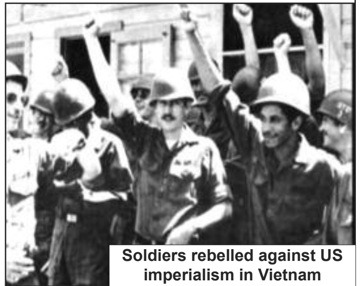
Soldiers rebelled against US imperialism in Vietnam

"Hey, I heard that your son is in the army. Where is he stationed?" a co-worker and Red Flag reader asked me.