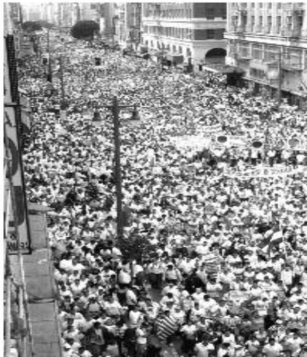
Los Angeles: One million marchers protest attacks on immigrants, 2006

THE NEWSPAPER OF THE INTERNATIONAL COMMUNIST WORKERS' PARTY * WWW.ICWPREDFLAG.ORG