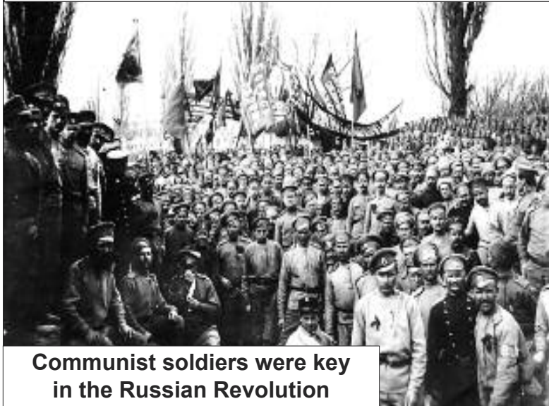
Communist soldiers were key in the Russian Revolution