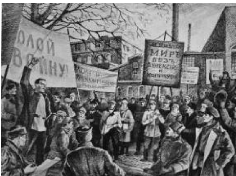
Communist-led Workers Rally in Petrograd, 1917

Today the struggle is even sharper. Some