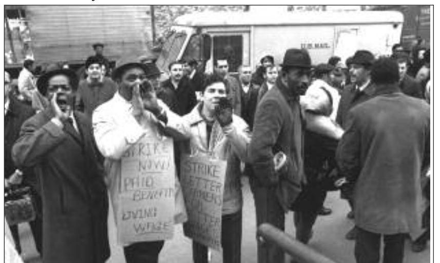
1970: Nationwide Strike shut down US Postal Service

We're not just dreaming. We're distributing Red Flag and Mobilizing the Masses for Communism to postal workers and talking with them. The growing attacks on us make it more urgent to spread the fight for communism. We're working to mobilize the masses to think about and organize to get rid of racist capitalism with communist revolution worldwide, and how to build our new society. Join us!