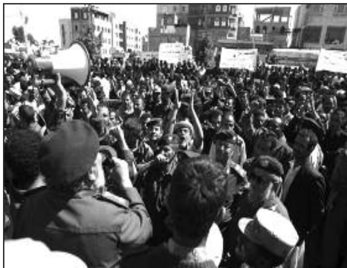
The Yemeni government is desperately trying to crush a wave of mutinies at military airbases. Rebellious soldiers have demanded the ouster of officers who steal from them and amnesty for those who refused to fire on protesters.

For the imperialists, serious steps need to be taken before launching the next war. First, the US