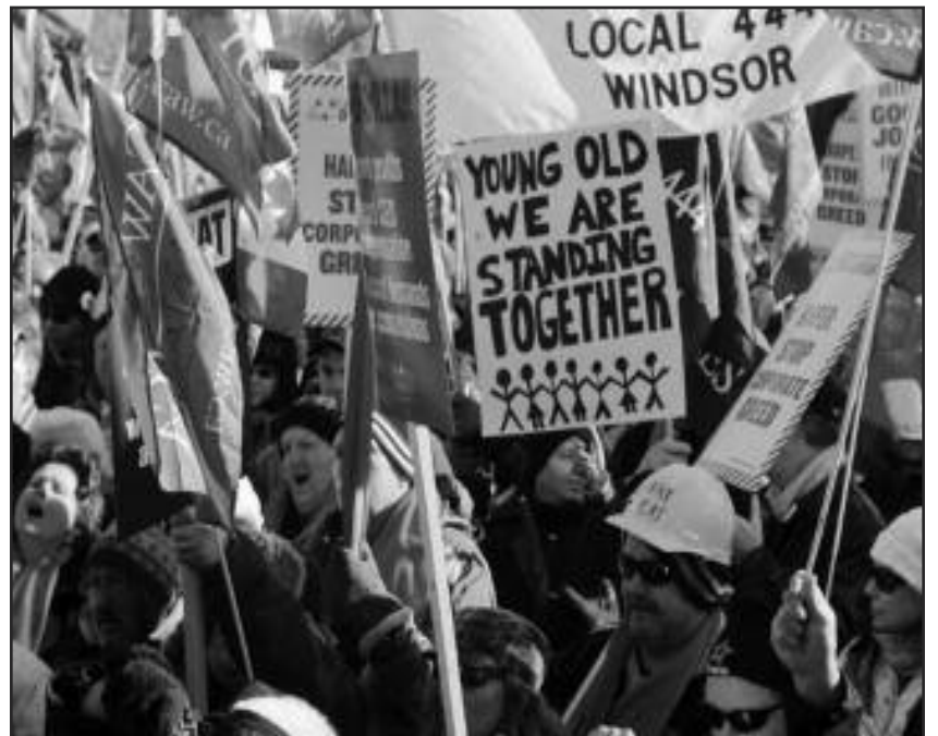
LONDON, ONTARIO, CANADA, Jan. 21—Caterpillar Inc locked out workers and threatened to move to the US after they rejected a contract offer that would have slashed wages in half and cut benefits while the company reports record profits.

Today, communist class struggle is our “classroom” as we organize for communist revolution and prepare to build communist society. Every Red Flag reader must become a teacher as well as a learner! Read, discuss, support, distribute, and write for our “textbook,” Red Flag !