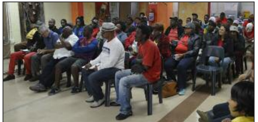
ICWP Conference in South Africa

He didn't know anything about dialectics but when I explained, everything was clear to him. He used to work in another area, then he joined NUMSA. Then he was appointed shop steward, then he went up the ranks, and now he's working for the union.