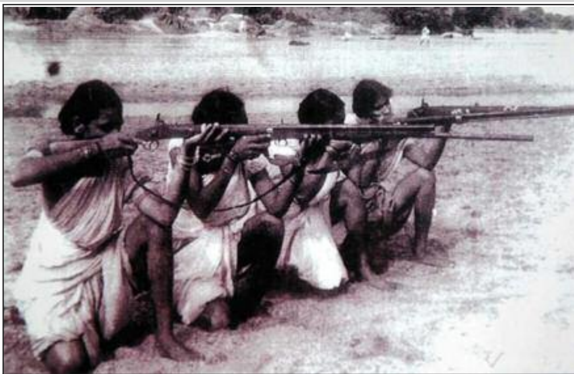
Dalit women in arms organized by Communists in 1930's

The rebellious peasants were classified as the