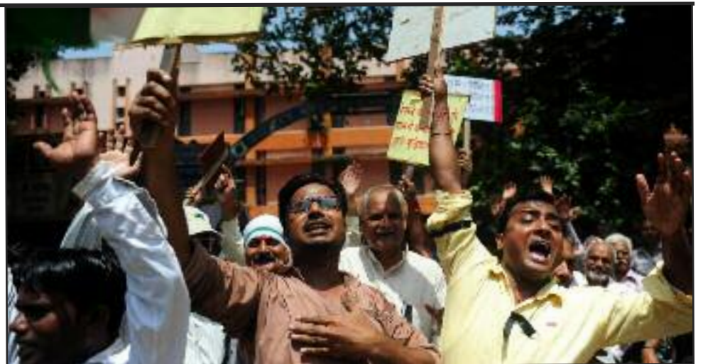
September, 2015--Railway workers in Allahabad during general strike against fascist Modi

In India, Pakistan and Bangladesh we have dramatically increased the circulation of Red Flag . Students and workers are joining ICWP and we are getting an enthusiastic response. We are distributing our main document Mobilize the Masses for Communism and efforts are underway to translate it into more languages.