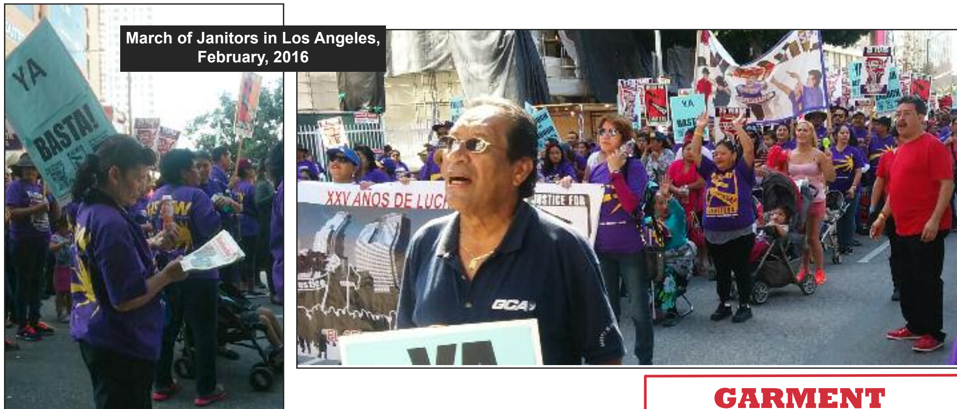
March of Janitors in Los Angeles, February, 2016

THE INTERNATIONAL COMMUNIST WORKERS' PARTY * WWW.ICWPREDFLAG.ORG