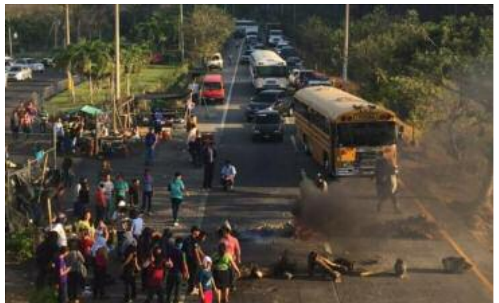
Garment Workers in Olocuilta, El Salvador block highway to denounce capitalist robbery

We have a task as ICWP members and that is to create communist networks among the working class through Red Flag . The struggles must be fought by everyone. Solidarity is a fundamental aspect of the struggle for communism. This will only be possible if we have full confidence that Communism is the only solution.