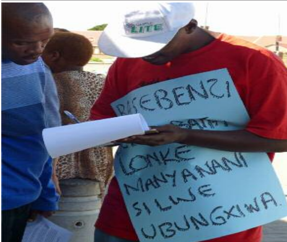
South Africa: The sign says “Workers of the World Unite for Communist Revolution” In Xhosa

I replied, “Look, there’s no need for that. Even if it went all over South Africa, it wouldn’t be powerful enough because the system is global, so we would be fighting a global system with a domestic organization.” I told him that, fortunately, an organization already exists that is exactly like the one he wants, that directly fights against capitalism and for communism. And it’s international. That organization is the ICWP, the International Communist Workers’ Party.