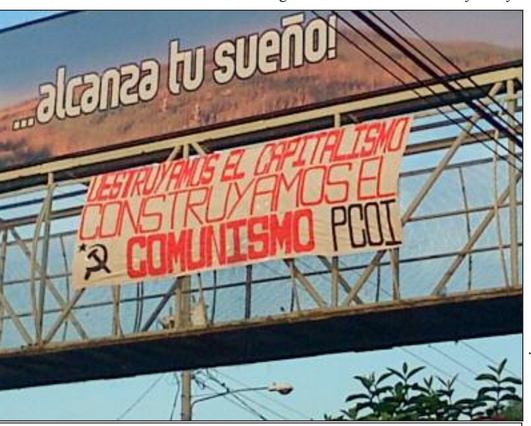
Achieve your dream! LET'S DESTROY CAPITALISM LET'S BUILD COMMUNISM (ICWP BANNER, MAY DAY 2013 EL SALVADOR)

"We have carried out strong work with our co-