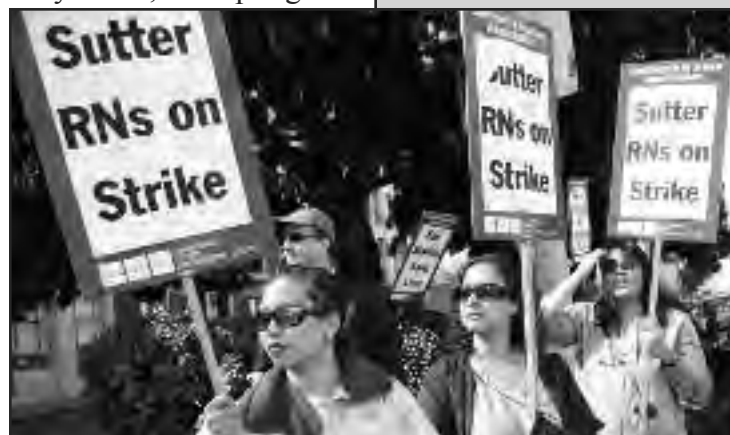
Nurses in the San Francisco Bay Area, 2011.

California nurses are preparing to strike on May 1 against a contract that would cut their own health benefits. Under capitalism, they, like other workers, can't afford what they, themselves, produce. Communism will bring health care and meaningful work for all.