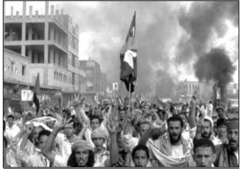
Uprising in Yemen. See front page article.

She didn't mention revolution, and her reference to "hyper capitalism" implies that there is some kind of "non-hyper" capitalism that doesn't need racism to survive. We know that the only way racism will end is not through a mass social movement to end mass incarceration but through a mass movement of workers fighting for communism. We should read The New Jim Crow to better understand the historical development of racism in the United States, but only hand-in-hand with our un-