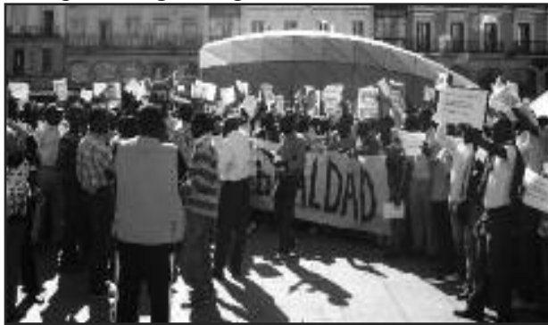
2009-African workers in Spain demand equality and an end to racist police murder.

The electricians haven’t gotten working-class leadership. Once the government dissolved the Light and Power Company, the leaders misled the workers. They pushed them to defend the “public enterprise” against privatization, to defend the