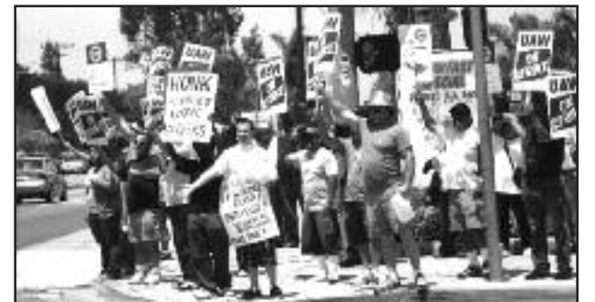
Students bring communist ideas to Long Beach Boeing strikers, 2010. Summer Project volunteers will be back this summer with Red Flag for Boeing workers in Long Beach and Seattle!

Victory requires that our future not be undermined by illusions. During the 2011 summer project we will be fighting for a communist program for the upcoming contract battle. We must prepare now for a political strike that takes aim at the nonsensical notion that labor law is classless.