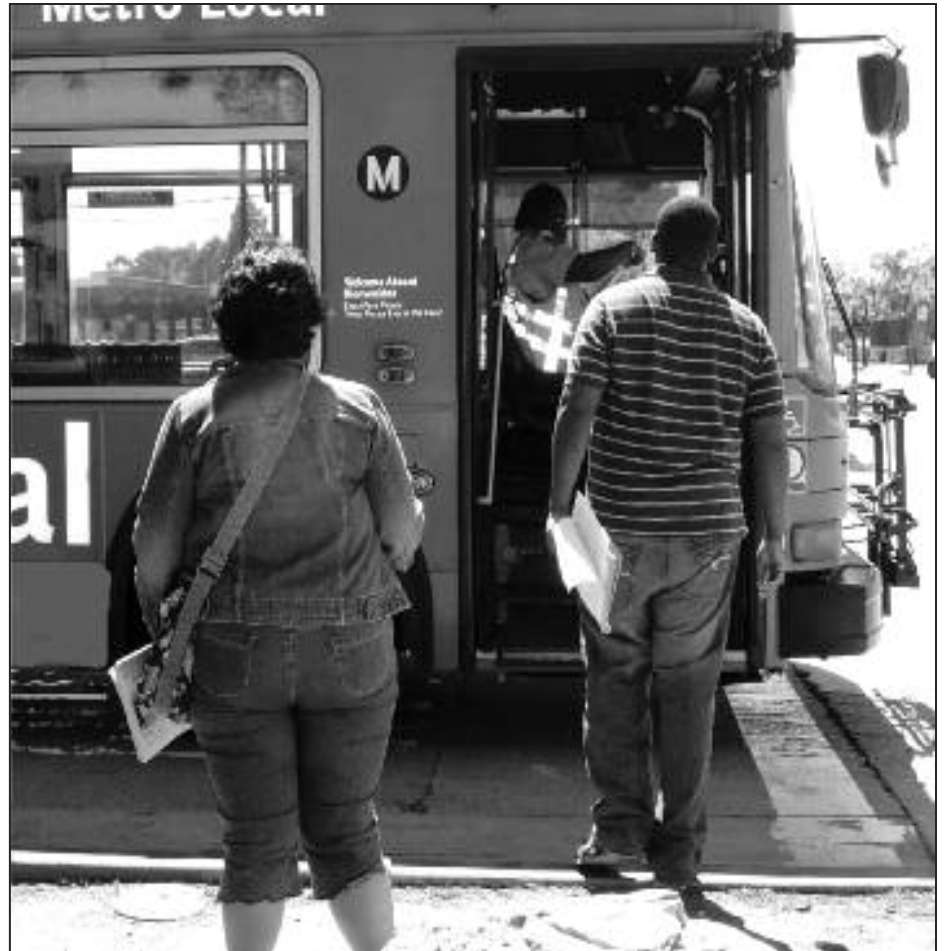
Distributing Red Flag to MTA drivers, 2011 Summer Project

The process of developing more and better communist leadership is happening right now. Step up at Metro and everywhere!