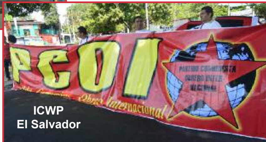
ICWP El Salvador