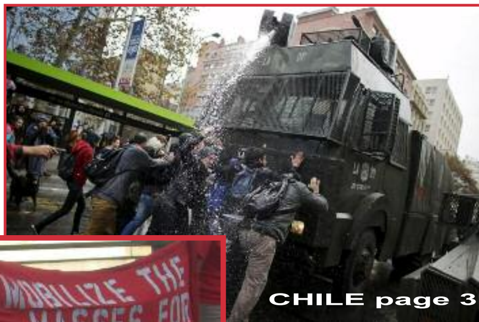
CHILE page 3