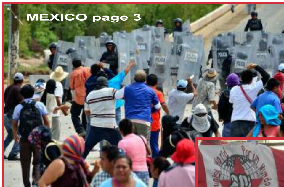
MEXICO page 3

THE INTERNATIONAL COMMUNIST WORKERS' PARTY * WWW.ICWPREDFLAG.ORG