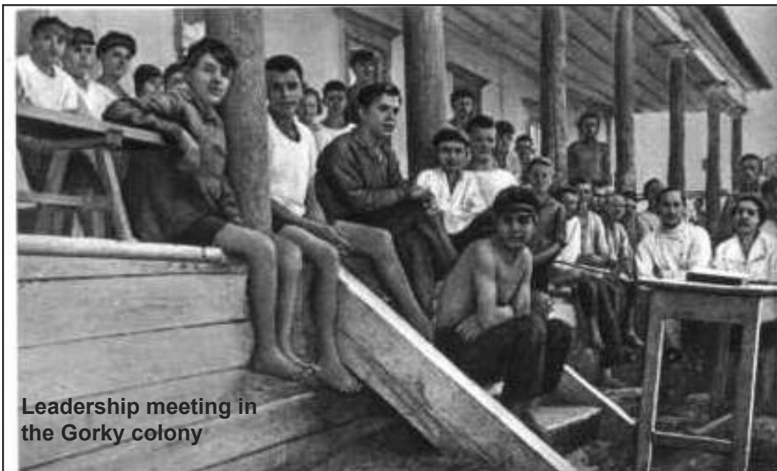
Leadership meeting in the Gorky colony

All quotations from The Road to Life: An Epic of Education by Anton Semyonovich Makarenko