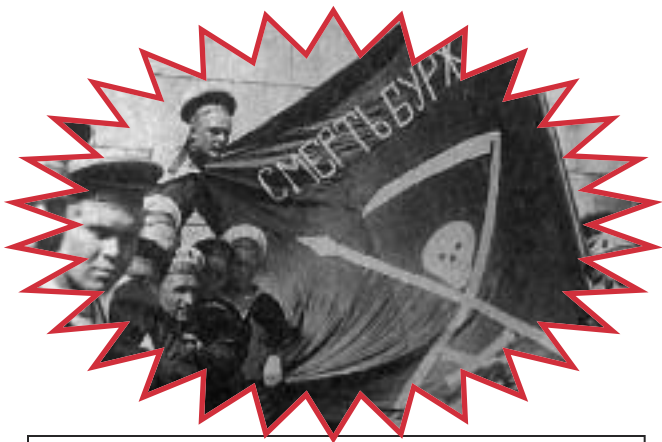
Russian mutineers in March 1917. Banner reads: "Death to the Bourgeoisie"

Many of these movements were motivated by immediate issues like bad food and imperialist war, but they all had leftist leadership, usually communists. All made a big difference in the revolutions of the time. These movements show us that especially in times of war, sailors can be won to fight for communism if they have communist ideas. This gives us confidence that we can build our own Red Army during the current crisis and the imperialists' preparations for world war. We should be inspired by these brave and determined rebels to recruit large numbers of soldiers and sailors as we mobilize the masses for communism.