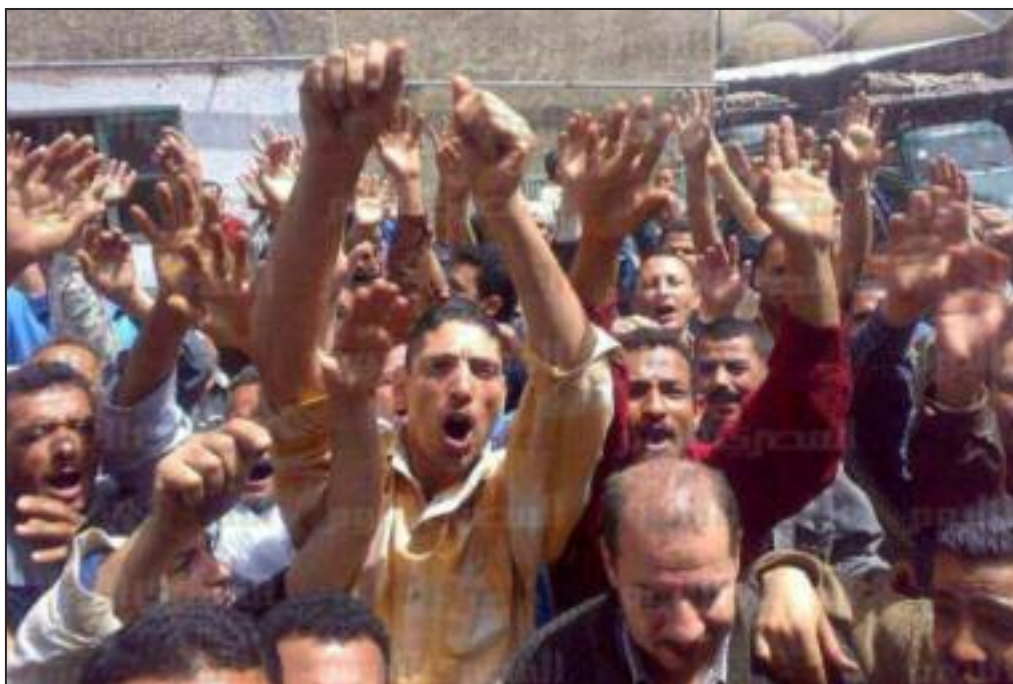
Egyptian activists are watching the situation in Turkey with great interest.

(Mubarak) only to get another (Morsi) and now many are looking for solutions beyond "democracy" (elections). "Even the old man sitting by the roadside is talking politics," said an Egyptian reader of Red Flag .