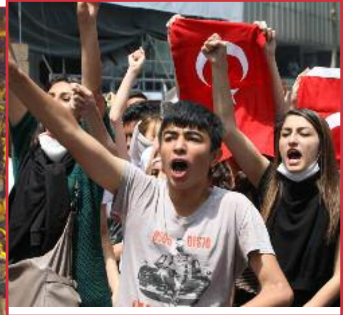
Above: Turkish youth Demonstrate Left: Masses In Brazil Take to the Streets to Protest Capitalism (See articles page 2)