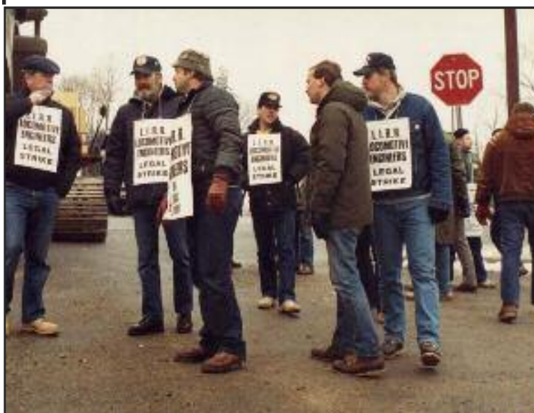
July 15—As Red Flag goes to press, Long Island Railroad (LIRR) workers in UTU are preparing for a July 20 strike, the first since 1994.

The New York Metropolitan Transportation Authority (MTA) wants to double workers' contributions to health care and make them pay into the pension funds forever (instead of for 10 years). MTA also wants to double the time it will take workers to reach top pay, from 5 years to 10 years. Workers have been on the job without a contract since 2010.