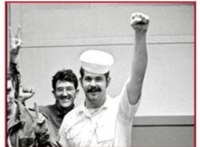
Sailors aboard aircraft carriers Midway, Coral Sea, Constellation, Forrestal and Kitty Hawk, among others, organized mass rebellions against racism and the Vietnam War.

If we consider Native Americans living in North America during the 1600s, for example, their communal society and its corresponding