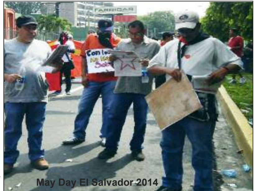
May Day El Salvador 2014

A worker indicated that it was necessary to read Red Flag , and that working men and women have to pay attention to the MTA articles and how they relate to workers' struggles all over the world and how they can be resolved in favor of the working class.