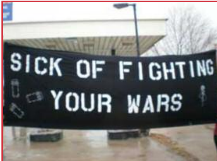
Banner at a protest at Fort Hood, Texas, demanding better medical care for Iraq-era vets

A young friend with whom I served in Iraq recently attempted to apply for medical assistance for post-traumatic stress. He is currently unemployed and facing psychological stress. But he has been denied services. Another Iraqi War veteran friend is close to hitting his 20-year service with the Army. He tells me that the Army is trying