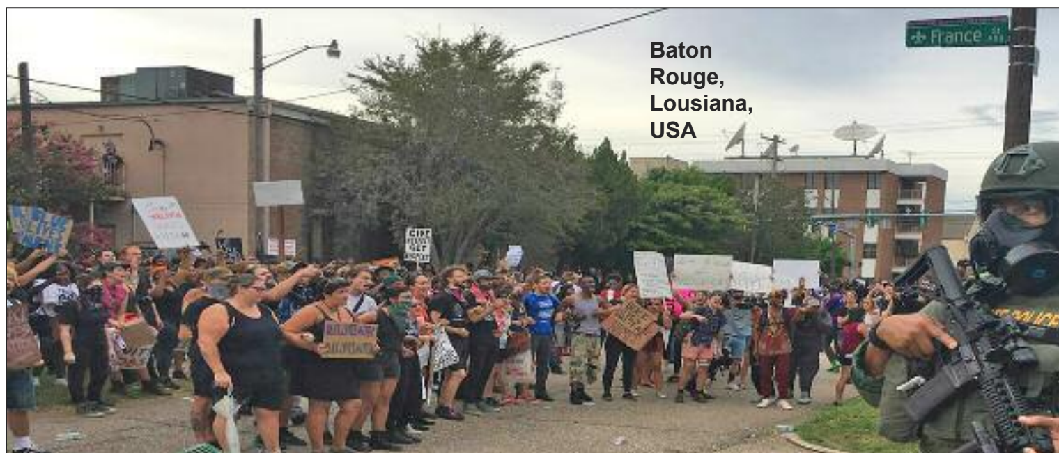
Baton Rouge, Louisiana, USA

And we invite all workers to distribute Red Flag and to join ICWP to create what we need—a communist revolution.