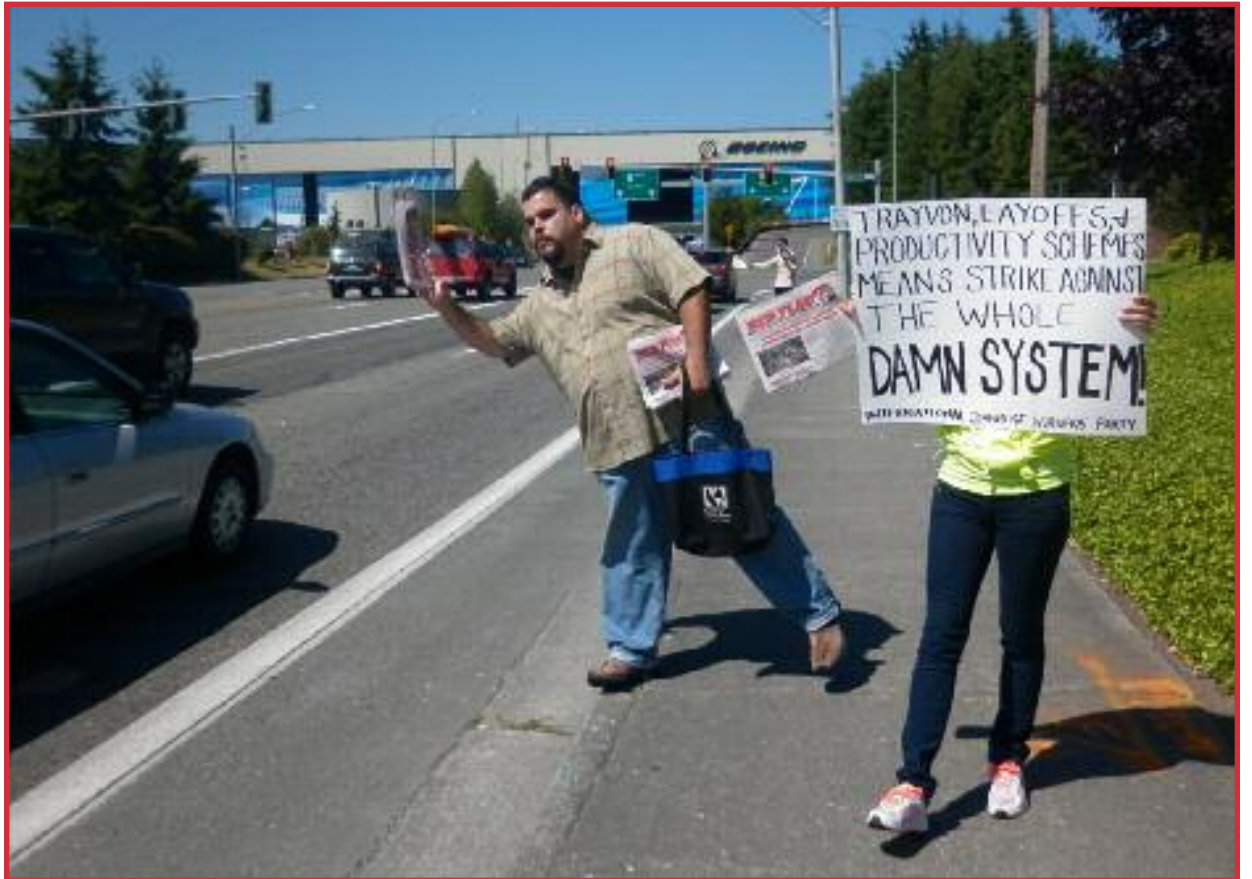
Summer Project Volunteers Distribute Red Flag at Boeing Factory in Seattle--See article page 8.