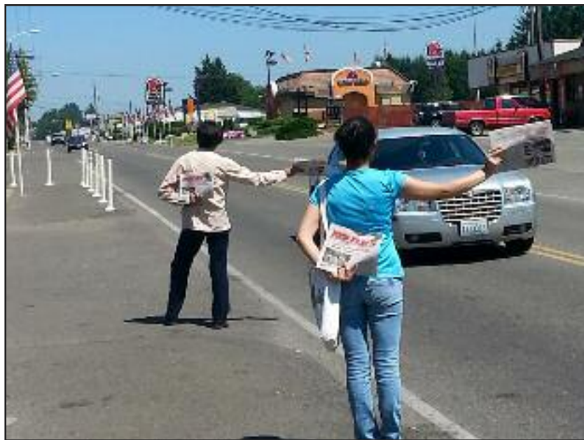
Summer Project Volunteers Take Communist Ideas to Soldiers at Joint Base Lewis-McCord