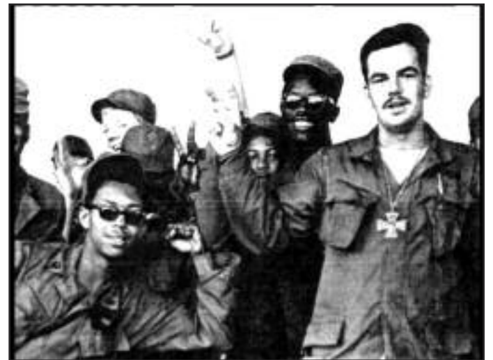
GI Resistance in Vietnam

All industrial workers who read Red Flag should encourage their young relatives to join the army to mobilize their fellow soldiers for communism. In this way, we will prepare the soldiers of the world to ally with the workers of the world to fight for communism.