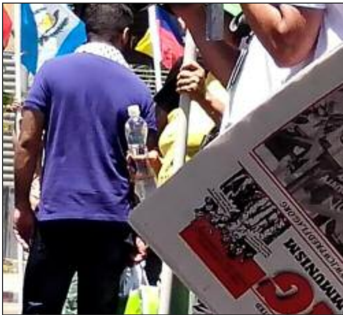
LOS ANGELES July 24-- Protestors denouncing Obama's deportations and support for Israeli genocide in Gaza eagerly took Red Flag .

We workers will have red areas where communism is working and preparing to advance the world over, where all will be welcome. Let's fight for a communist world without borders and bosses. Join ICWP.