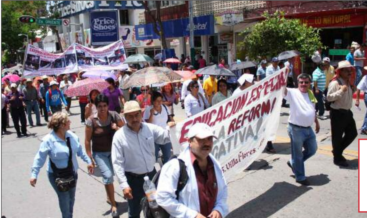
July 8, 2013 10,000 teachers in Tuxtla-Gutiérrez, Chiapas, Mexico join national mobilization against educational reform

THE NEWSPAPER OF THE INTERNATIONAL COMMUNIST WORKERS' PARTY * WWW.ICWPREDFLAG.ORG