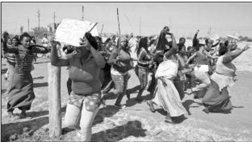
Wives of Lonmin miners protest police massacre.

One student said he supported democracy. When a Red Flag seller explained that democracy was invented by Greek slave-owners to justify class society, the student laughed heartily and said, "I'll read this paper!"