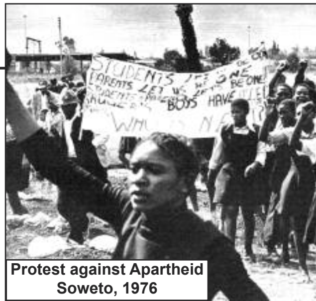
Protest against Apartheid Soweto, 1976

A reconciliation process ended Apartheid in 1994. Nelson Mandela and the Communist Party were unbanned. An officially “non-racial” capitalist state was established. The legacy of Apartheid, and the nature of capitalism itself, however, have made South Africa the most unequal country in the world for all racial groups. While there are now poor whites, there are also rich and powerful, cops