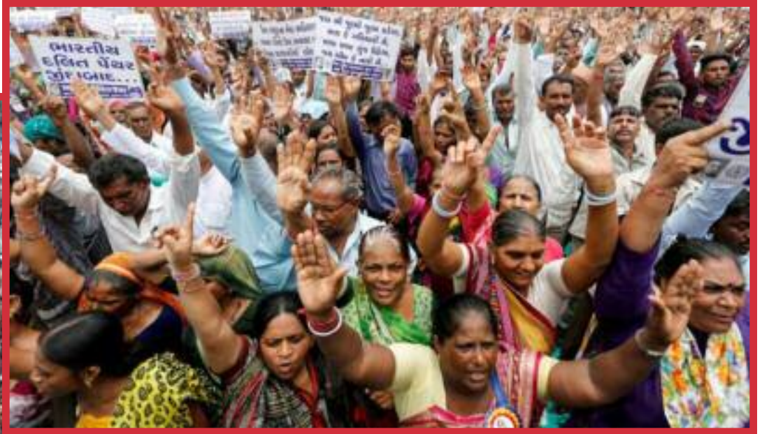
Masses protest attacks on Dalit workers in Gujarat, India