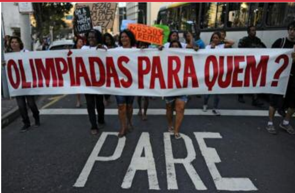
Protest in Rio: “Olympics for Whom?”

In communism, sports will not be used as an