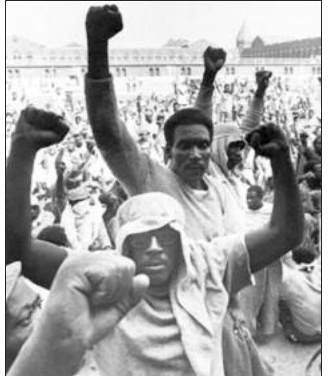
Attica, New York, 1971

Private prisons are filling up with black and brown people. Many have been convicted of