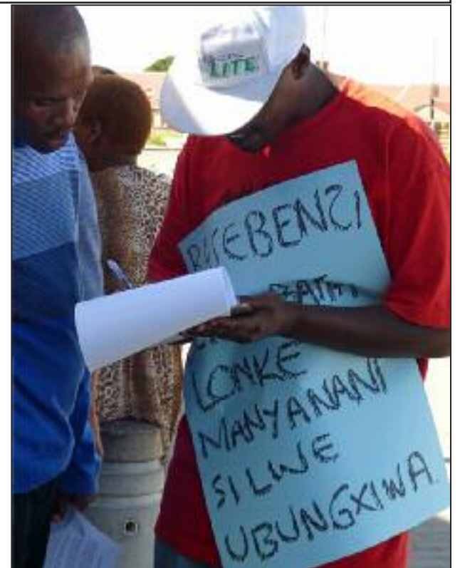
Sign says in Xhosa: “Workers of the world unite for communist revolution!”

What is primary is practice: recruitment, going to the factories, schools and telling people about capitalism and communism. While