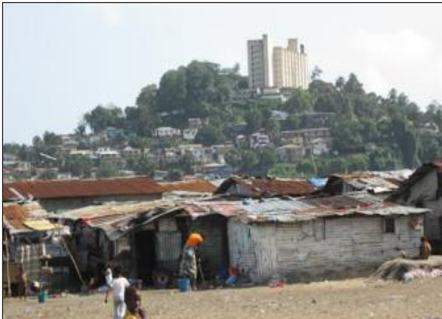
West Point slums in the shadow of rulers' luxury

The West Point rebellion shows again the potential to build the International Communist Workers' Party in Africa and worldwide.