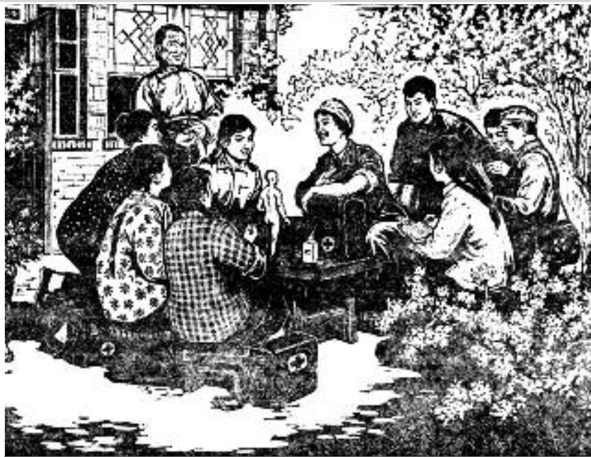
Barefoot doctors doing village health education in China in the 1950s.

Communist-inspired masses can accomplish amazing feats. Massive outbreaks of diseases and natural disasters could be brought under control by huge numbers of well-trained workers ready to jump in at a moment's notice. Their prime mission will be to help organize masses locally to provide the care needed.