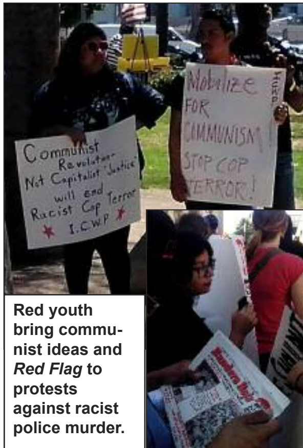
Red youth bring communist ideas and Red Flag to protests against racist police murder.

This has only gotten worse since 9/11, when