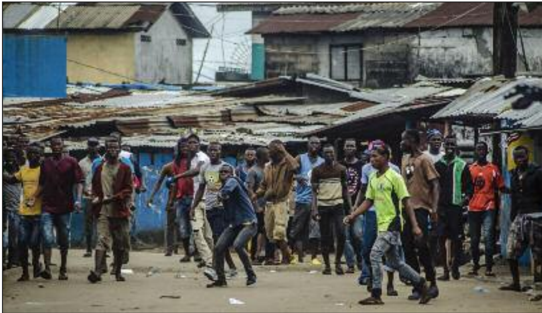
Workers in West Point confront riot cops enforcing Liberia quarantine

A week later, after consultation with Obama, Liberian President Ellen Johnson Sirleaf tried to calm things down with a half-hour tour of West Point. Her entourage, surrounded by concentric circles of heavily armed guards wearing surgical