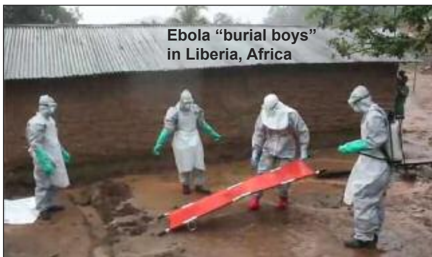
Ebola "burial boys" in Liberia, Africa

The masses of workers can only move forward under the banners of communism. We in the ICWP agree with these brave young workers in Sierra Leone and Liberia...we have no choice but to act and fight for the collective!