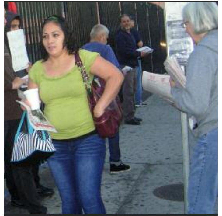
Workers at American Apparel receiving Red Flag

In their thirst for profits and preparations for war, the bosses hire more workers, creating more opportunity for those who are exposed to communist ideas and take up the task of communist revolution. Currently in Los Angeles, an average of 1,000 garment workers take Red Flag every issue. This creates huge potential to develop