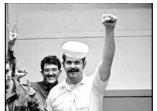
Thousands of Sailors and Soldiers During the Vietnam War Refused to Carry Out the Murderous Orders of the US Imperialists

But we have another option, and that option is to take matters into our own hands and build a communist revolution that fights for the needs of workers around the world. We should build on the unpopularity of war among workers, soldiers and sailors and spread communist revolutionary ideas so that we lay the groundwork for a communist society. In these moments, soldiers can play a key role in leading the whole working class in fighting to turn the bosses’ wars for profit and empire into a fight for communist workers’ power.