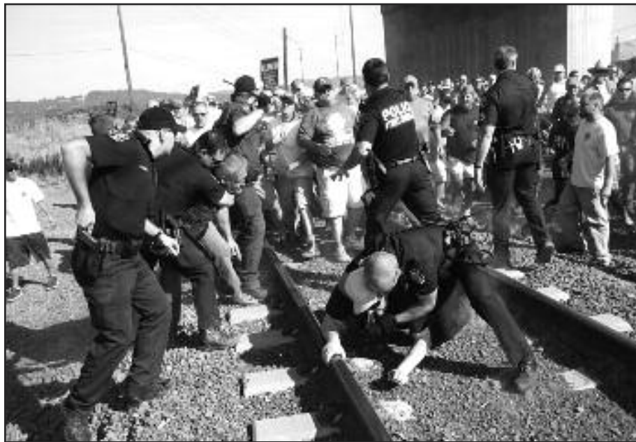
Longview longshore workers, seeking to stop grain shipments, fight the police

“If we limit ourselves to non-violence, we will fail. Under communism we will violently defend our class against any threat to workers’ power.