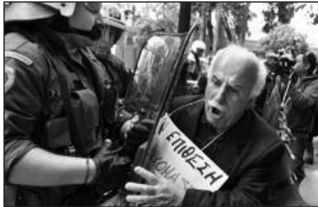
Workers and Youth Paralyze Greece in Protests Against Austerity Plan