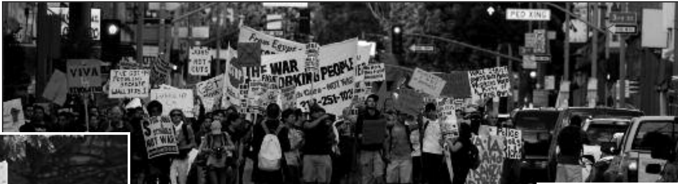
"Occupying" Wall Street and Los Angeles

NEWSPAPER OF THE INTERNATIONAL COMMUNIST WORKERS' PARTY * WWW.ICWPREDFLAG.ORG