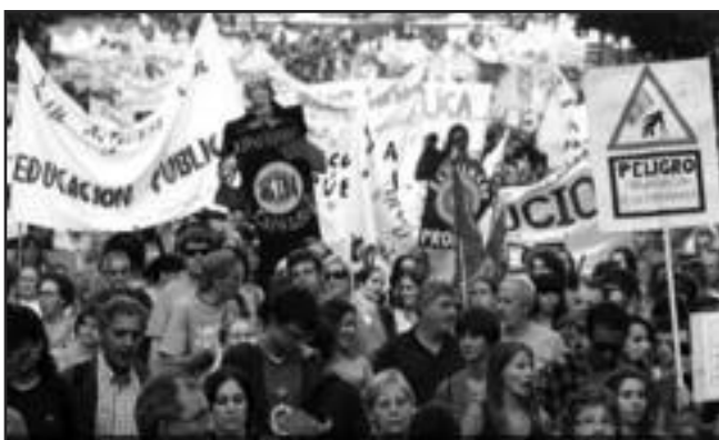
SPAIN: Teachers strike against cuts

We responded that it’s absolutely true that workers don’t need capitalists and that capitalism can’t survive without workers producing profits for the bosses. But a general strike, especially a nonviolent movement like the one Gandhi led in India, can’t lead to the emancipation of the working class. Look at India now! What it’s going to take is armed revolution and mobilizing the masses for communism.