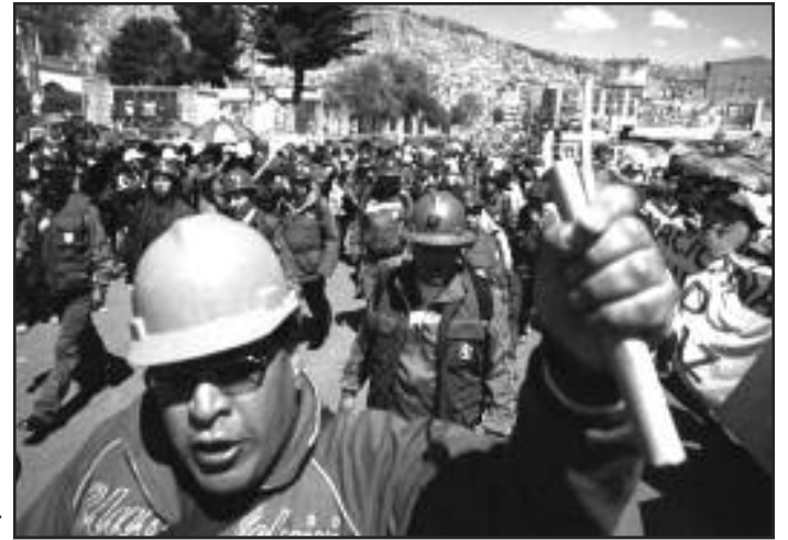
Bolivia: miners strike in support of indigenous workers

is making it a point of struggle. We suggested that everyone should go to their workplaces and let people know about this struggle through Red Flag , circulate letters of communist support, and send them to the longshore workers. Our struggle for a communist world continues, one step at a time.