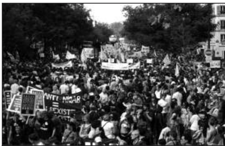
Mass French Protest Against Anti-Roma Racism