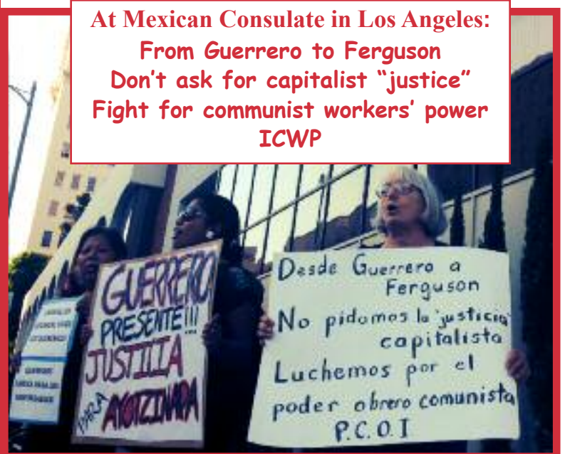
At Mexican Consulate in Los Angeles: From Guerrero to Ferguson Don't ask for capitalist "justice" Fight for communist workers' power ICWP

Mexico: Seizing radio stations, blocking entrances to banks, burning the city hall and the government palace in Chilpancingo, students and teachers protested militantly and massively. We invite them and the whole international working class to join us in building a revolutionary communist movement that burns down all of capitalism so that on its ashes we can build a communist world.