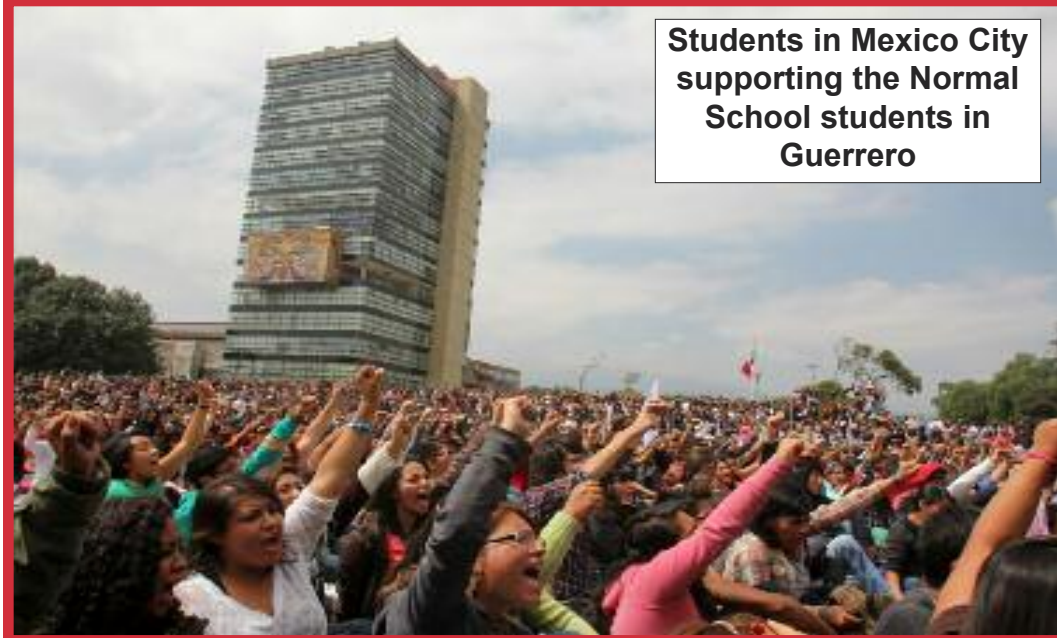
Students in Mexico City supporting the Normal School students in Guerrero

THE INTERNATIONAL COMMUNIST WORKERS' PARTY * WWW.ICWPREDFLAG.ORG