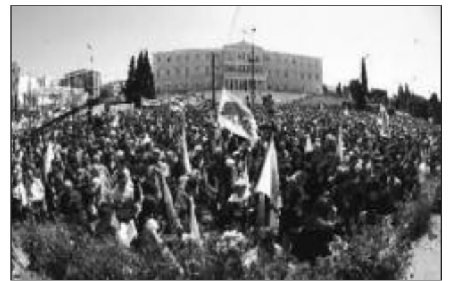
ATHENS, GREECE, Oct. 18. Striking Greek workers surround Parliament to prevent legislators they had elected from going in to vote for the interests of the banks.

This leaves us with the urgent task of building the communist press. Red Flag fights directly for communism. It is produced by the commitment and support of workers, soldiers and students in half a dozen countries. The task of the hour is to spread it around the world. We need your help to do this--and you need Red Flag .