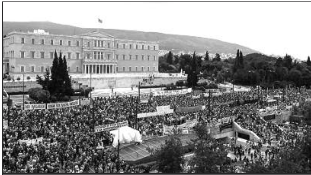
Greek workers surround Parliament to prevent elected representatives from voting to support the Euro-zone bail-out. Only communism can solve this crisis.

Rather than once again saving these capitalist institutions, we have to mobilize to shut down the capitalist's crap game once and for all.