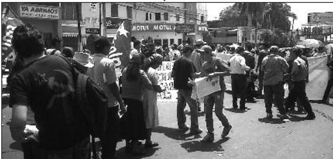
El Salvador, May Day, 2011

The industrial workers together with the soldiers are key on the road to communist revolution. It's our task to organize them into ICWP. Distributing and increasing the networks of Red Flag is an important step in the organization of the working class for communist ideas. We, the workers, day-by-day in our own flesh endure the cruelty of the capitalist system. We are the ones who must destroy it with a communist revolution.