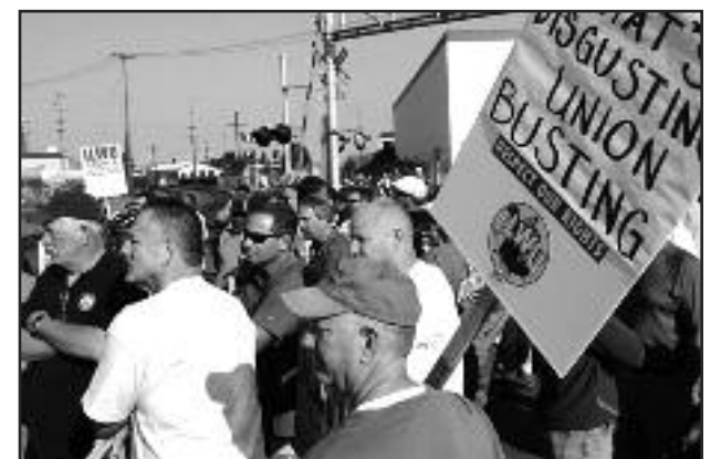
Longview, Washington, longshore strikers face off against cops

This action of signing the letter gave us the opportunity of struggling with those same signers to join ICWP and to help massively distribute our newspaper Red Flag and the document Mobilize the Masses for Communism (MMC).