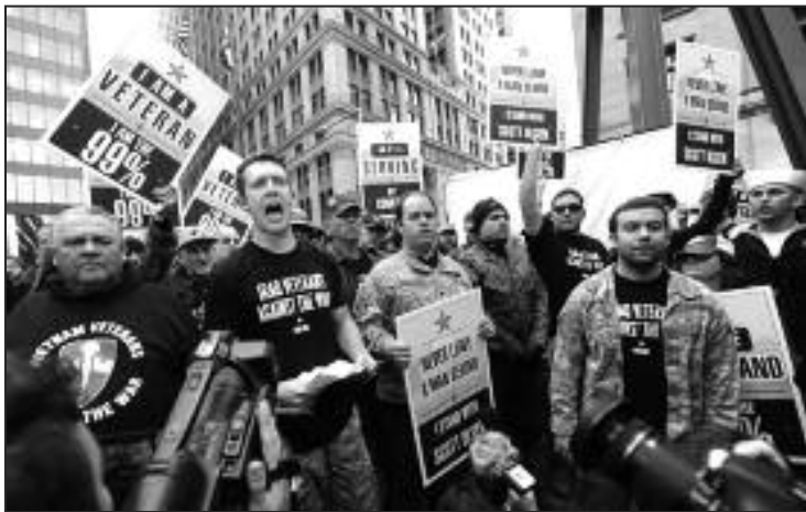
Angry Veterans of US wars from Vietnam to Iraq protesting at Occupy Wall Street. Soldiers and sailors are key to communist revolution; see articles on page 4

As the Asia-Pacific region, however, becomes less dependent on external markets, US influence will dwindle and China’s will grow exponentially. New trade alliances can make old military alliances obsolete. Hillary’s claim that “America has the capacity to secure and sustain our global leadership in this century as we did in the last” will be tested on the battlefields of WWII. Our task is to win workers and soldiers to turn the imperialist war into a class war for communism.