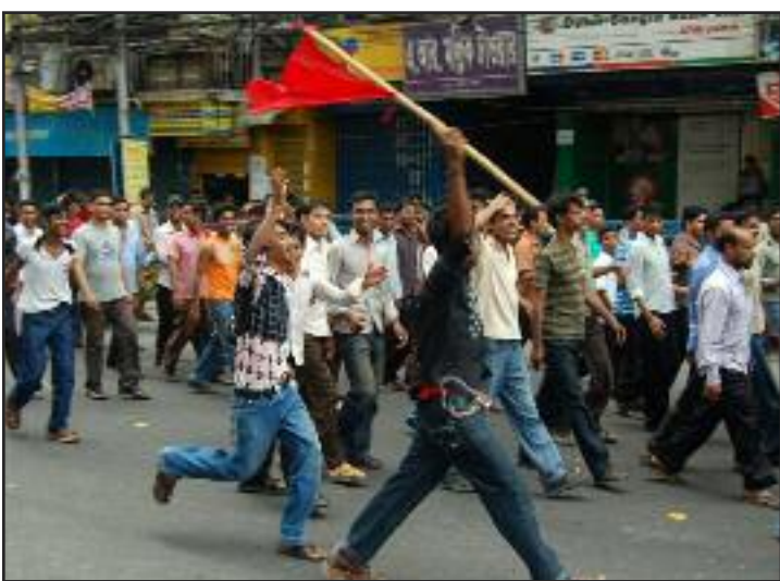
Garment workers in Mirpur, Bangladesh, May Day 2010

This huge amount of money is divided among the contractors, manufacturers, stores and