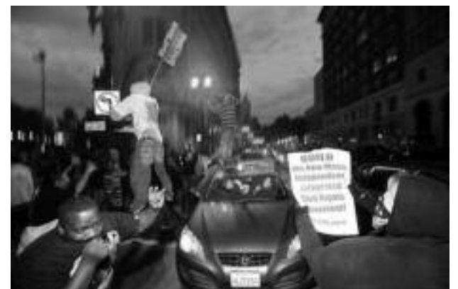
Oakland--Protest Against Verdict in Oscar Grant Case

The rising death toll of Haitian workers should lead us to spread Red Flag in Haiti and internationally to hasten the death of capitalism and the building of a communist society committed to workers' safety and power.