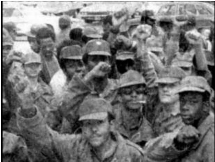
U.S. GI's refuse to follow bosses' orders in Vietnam

This political weakness can also be seen in the slogans during the insurrection. Their reformist slogans included: "Full democratic freedom of the press," "Improvement of the material and juridical condition of the peasants," "Unemployment allowances to equal