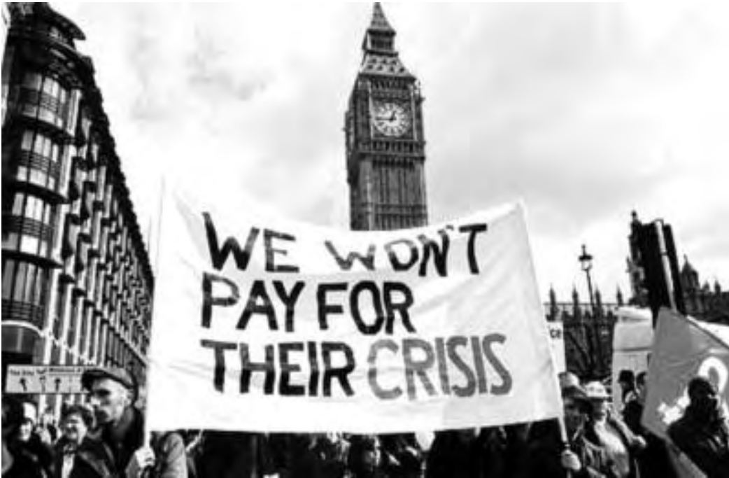
Workers Protest Capitalist Crisis, G-20 Conference, London, Spring 2009