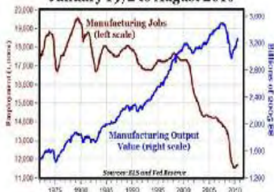
U.S. Manufacturing: Output vs. Jobs January 1972 to August 2010

Under communism there won't be any bosses, money or wage slavery. In a world without races, borders or nations – we'll eliminate the material basis for the bosses' poisonous ideologies of racism, sexism, nationalism and patriotism. Science, technology and the enormous creative power of the working class will be used to produce for humanity's needs, not for profits.