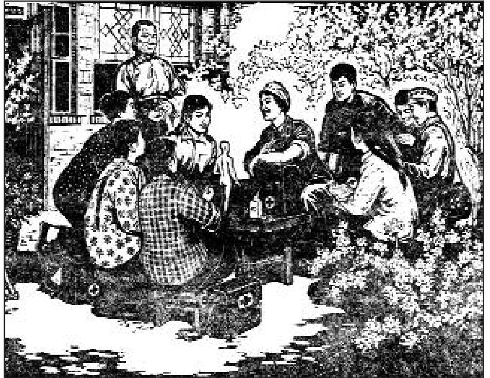
Barefoot doctors in China after the revolution mobilized the masses to insure healthy communities.

For adults, it's even worse because these centers are always saturated with patients and have no medicines. Sometimes they schedule surgeries up to a year later, which in most cases means imminent death. Women give