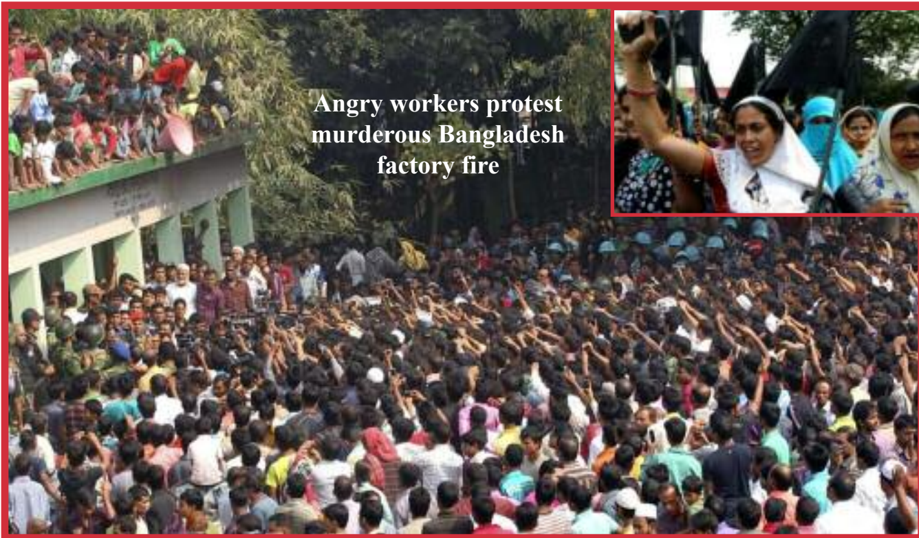
Angry workers protest murderous Bangladesh factory fire

International Communist Political School: