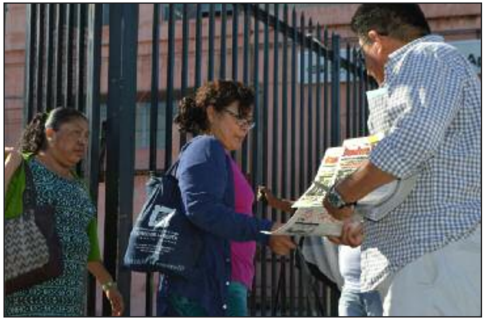
Workers at American Apparel taking Red Flag

Learning from their mistakes and successes—