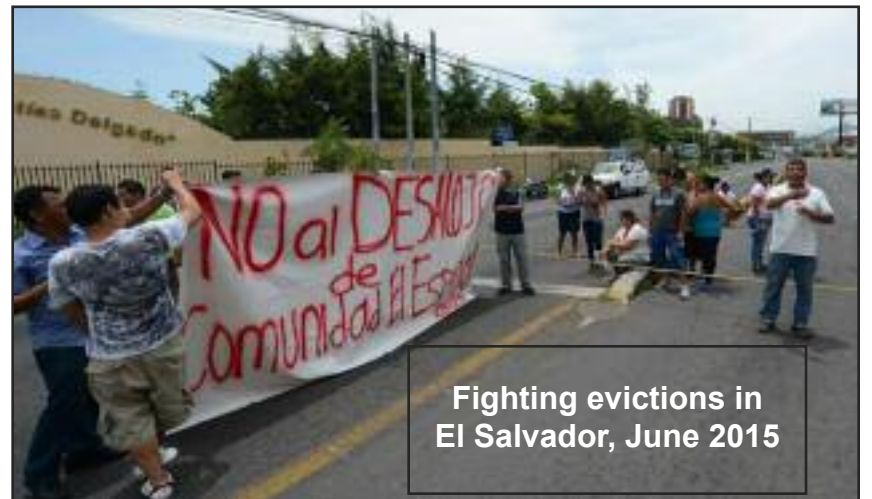
Fighting evictions in El Salvador, June 2015

It is plain common sense that workers and their families need housing and transportation. Under a new system, one that makes decisions based on the needs and will of the people themselves, such problems will no longer exist! This system will