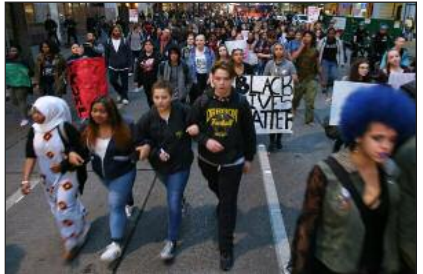
Post election protest in Seattle