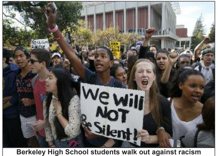
Berkeley High School students walk out against racism

Although the protests haven’t stopped the cops from killing people, they have forced the ruling class to expand its tactics. On November 22, a Black Lives Matter activist was roughed up at a Donald Trump rally, with Trump’s approval. The following day a UC