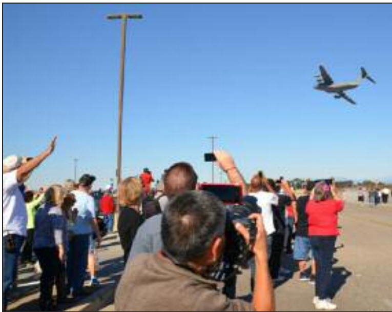
Workers wave goodbye to their jobs as the last Boeing C-17 military cargo plane takes off from Long Beach, CA, on Nov. 29. The plant, which had employed more than 2000 workers, will shut down at the end of this year.

The capitalist market only “demands” what workers can pay for. Communist production will not be con-