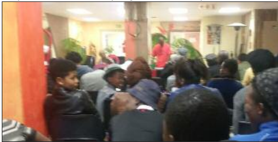
Youth in ICWP conference in South Africa

Red Flag is an important tool in the process of mobilizing the masses for communism. Let's distribute it, study it and write for it. Join the fight for a communist world!