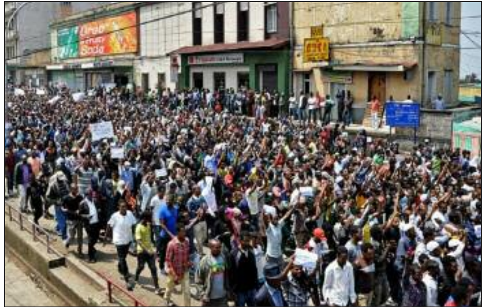
MASSES IN ETHIOPIA DENOUNCE RACIST SAUDI BOSSES

MASSES IN MOTION IN MIDDLE EAST/NORTH AFRICA SEE PAGE 8