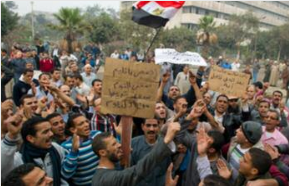
STRIKING WORKERS AT EGYPTIAN IRON & STEEL

THE INTERNATIONAL COMMUNIST WORKERS' PARTY * WWW.ICWPREDFLAG.ORG