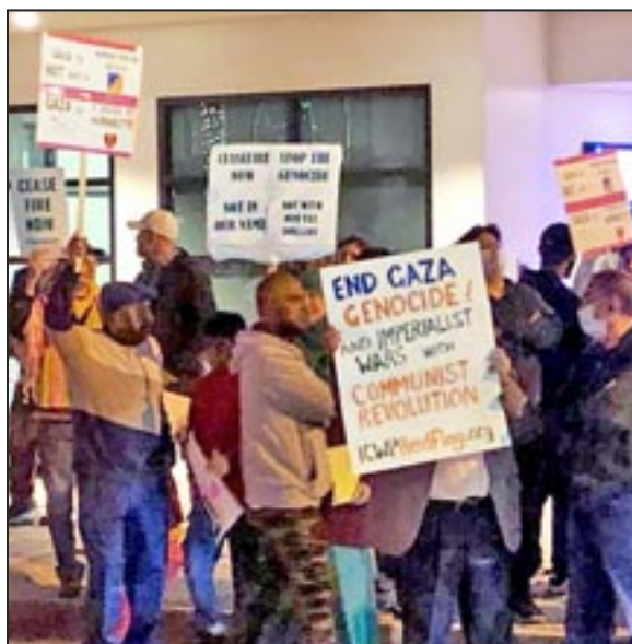
Pasadena, CA (USA), November 13, 2023 Weekly protests at offices of Rep. Judy Chu