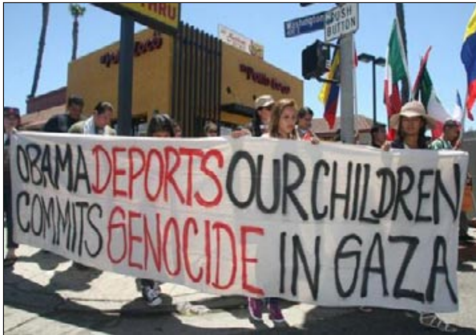
Los Angeles, CA (USA), 2014—Both US capitalist political parties have a long history of attacking immigrants and supporting genocide in Gaza.

All workers have the same interest: a communist society that meets the masses’ needs. The masses, armed with communist ideology and with weapons, will defeat Zionism and all fascism.