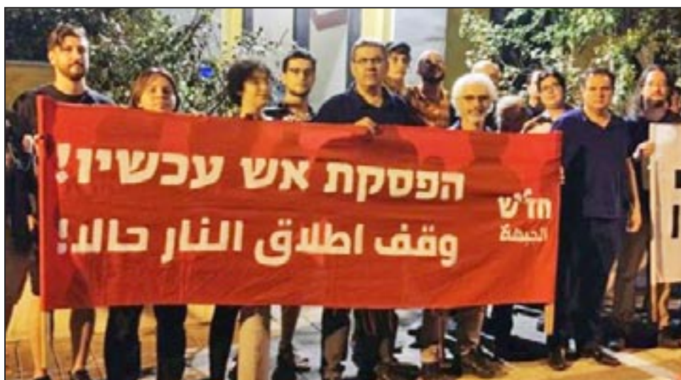
Tel Aviv, Israel—October, 2023

“Please Come Back! Immediate Cease Fire!” in Hebrew and Arabic