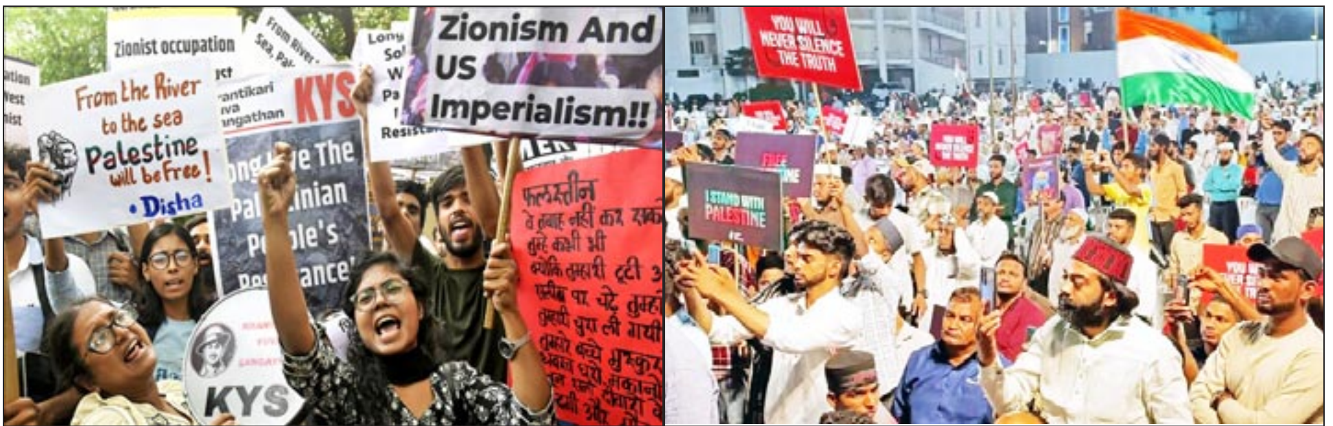
India, October 2023—In mass protests throughout India workers and students are protesting against the Zionist and US Imperialist genocide in Gaza.

We are on the path to building a mass party.