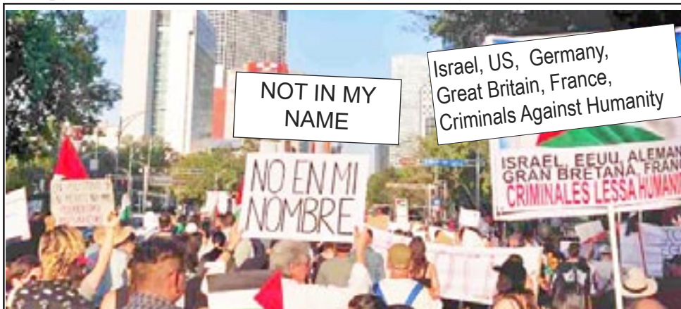
Mexico City, December 2023—In marches and university classrooms we have handed out flyers and Red Flag calling for a communist revolution to end the genocide in Palestine. Our ideas have an impact on the masses, especially our struggle against nationalism and to bring to the forefront the ideas of a communist world and nothing less.

Red Flag adds: A soldier in Port Elizabeth, South Africa, distributes Red Flag to his unit. He says that the Gaza genocide is making more soldiers see our line of recruiting communists. “The bosses are powerless if we refuse to fight for them.” Let’s follow his lead by recruiting more soldiers from the bosses’ armies everywhere. We must build one united Red Army. Neither Hamas nor IDF can bring peace. They are enemies of the working class. Let’s build a mighty ICWP of red soldiers to free the working class from wage slavery and genocide.