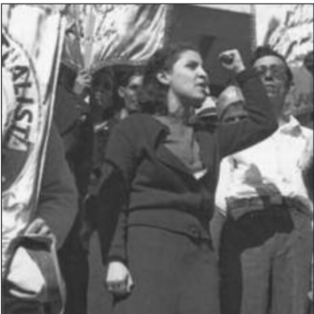
Communist Organizer Emma Tenayuca San Antonio, Texas, USA, 1936

First, Lewis and his henchmen directly assaulted communist organizers. They killed a number of brave comrades in this decade-long battle. The UMW signed sweetheart deals with mine owners to undermine strikes led by the communists.