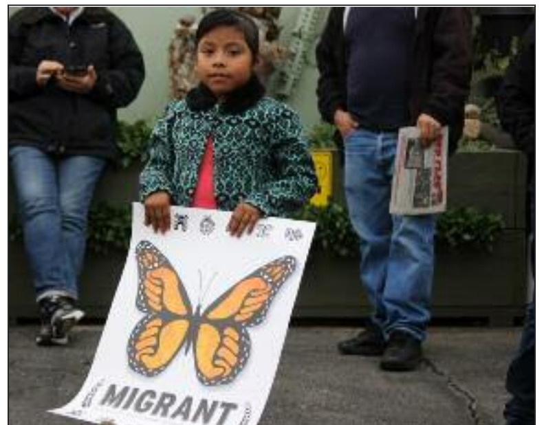
PASADENA, CA (US), Feb. 28 -- Hundreds marched in solidarity, demanding that city officials refuse to help federal officials enforce Trump's immigration policies. Nearly a hundred marchers took copies of Red Flag .