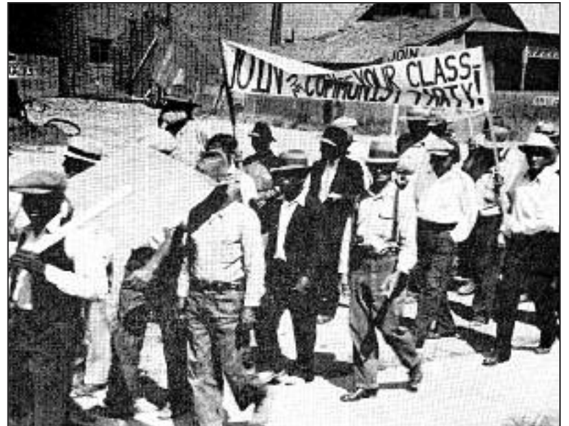
May Day, 1930, Phoenix, Arizona, USA