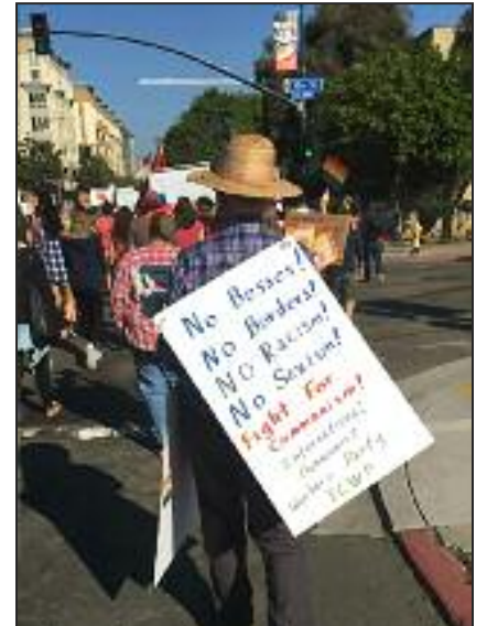
Comrades in Los Angeles and San Diego, USA, bring communist politics to International Women's Day activities