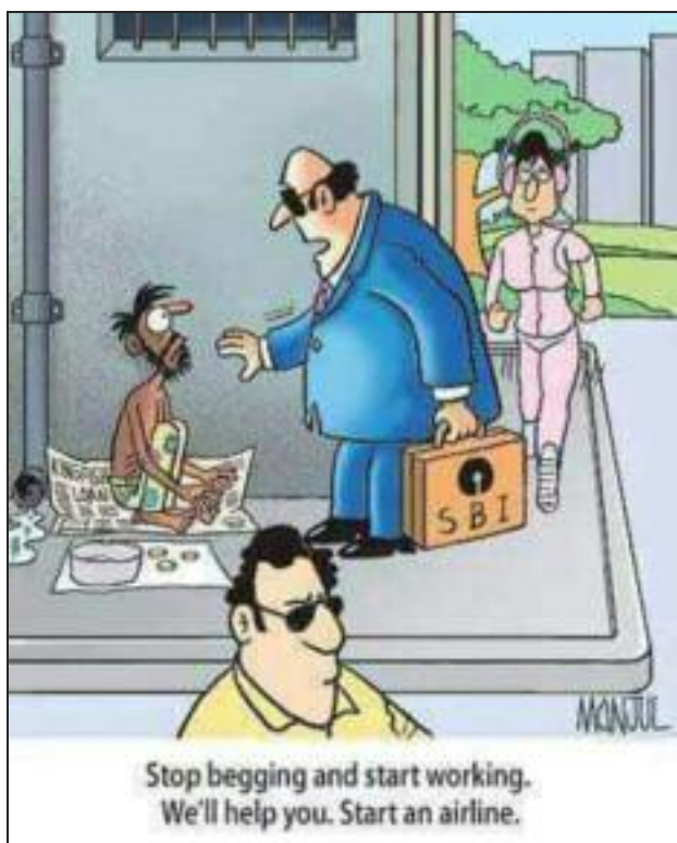
This cartoon from India Resists exposes the racism of the Modi government’s “Basic Income” plans

That’s why we must rely on more new communist organizers to mobilize masses for communism – starting right now, as we prepare for May Day.