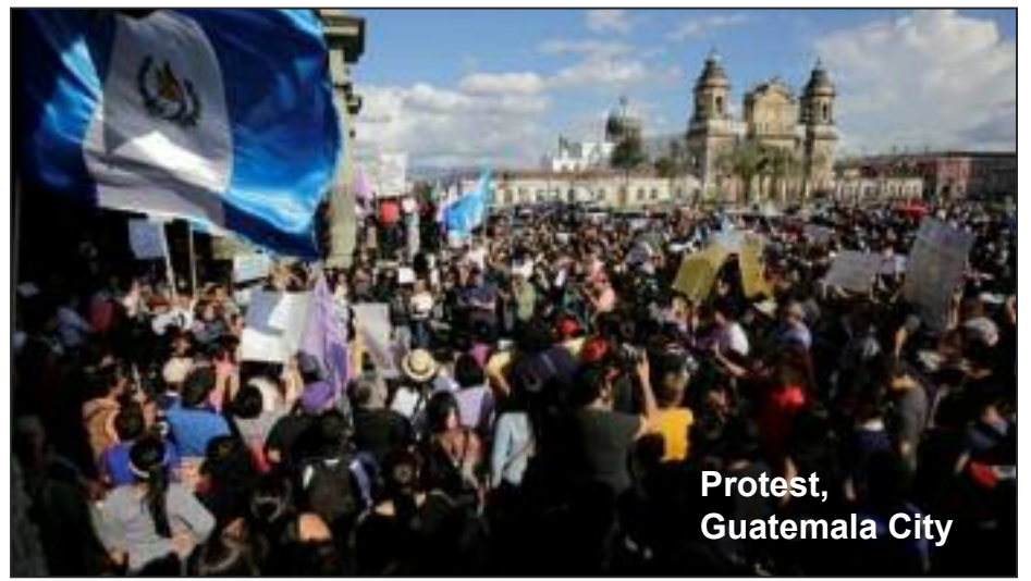
Protest, Guatemala City

Like in El Mozote (where the Salvadoran army murdered 800 people in 1981), Ayotzinapa (where the Mexican army “disappeared” and killed 43 protesting students in 2014), and Tlatelolco (where the Mexican government massacred an estimated 300 protesting students in 1968), these 40 girls and teenagers will not be forgotten. It is our duty as communists to make those responsible pay and to forge a world where this will never happen again.