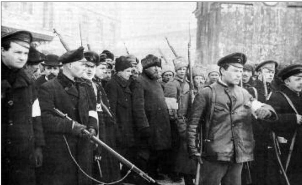
Armed workers defending the October Revolution

Revolution for reform did not and could not create the communist society actually needed by workers then and now. We have learned this great lesson from the Bolshevik Revolution: our program now and always must be to mobilize the masses directly for communism.