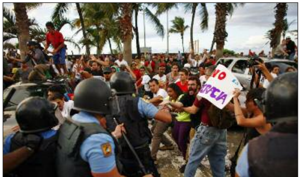
Strike at University of Puerto Rico, Spring 2017

National Liberation Movements after World War II turned colonies into capitalist countries. The bourgeois led the independence movements