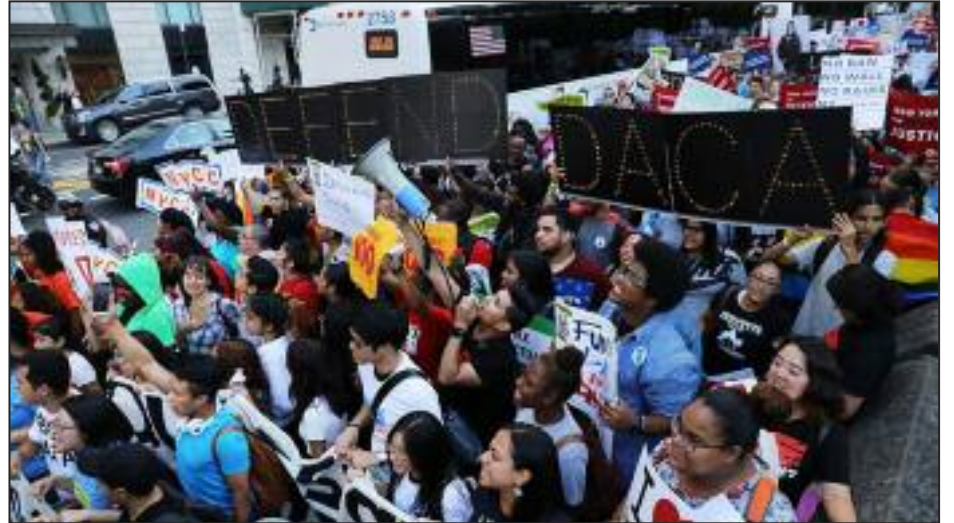
Detroit, USA—September 5