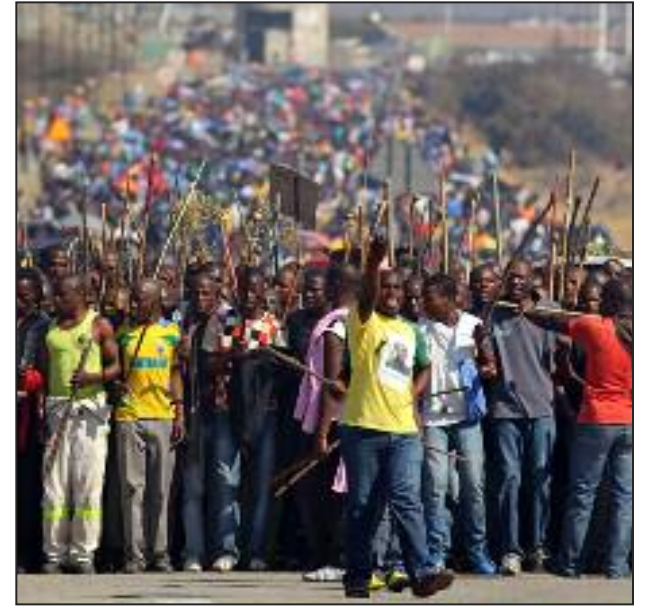
Miners’ strike, South Africa, 2012

And this is why it is more important than ever for our party to win over these workers so that they can fight for a communist society where they do not work for the bosses’ profit but the needs of the working class as a whole. That is why we plan to bring Red Flag to these miners as soon as possible.