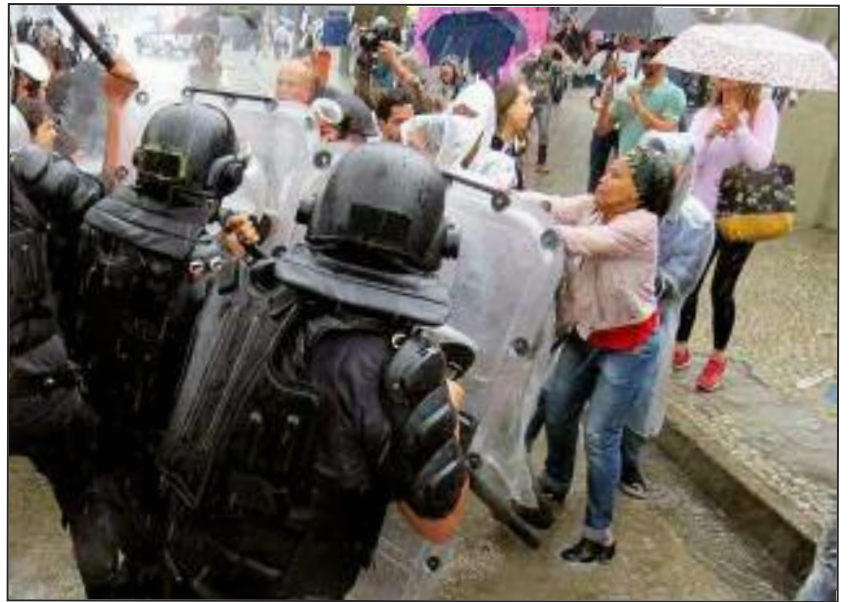
2014 Rio de Janeiro Teachers’ strike

The International Communist Workers’ Party (ICWP) is organizing workers around the world to create a communist society where the natural resources will be used for the need of the international working class and not for profit.