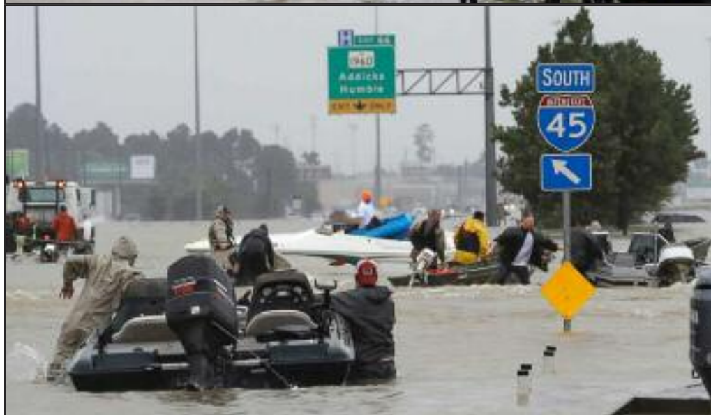
The working class saving the working class in Houston