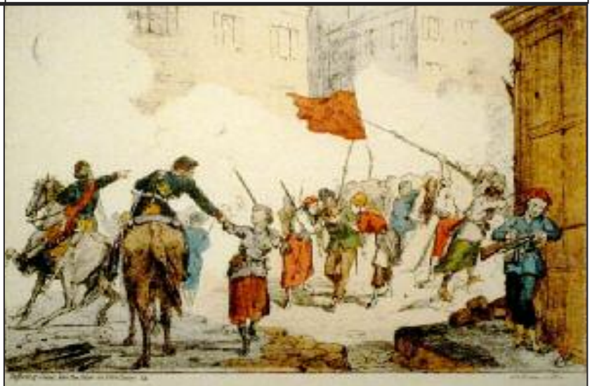
May 1, 1871—Barricades in Paris defended by women

The traditional right-wing party, the Republicans, is in disarray and split over whether to support Macron. The neo-fascist National Front lost badly in the runoff against Macron and is fight-