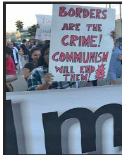
September 5—Protests erupt throughout the US over the government decision to end the DACA program which protected from deportation unauthorized immigrants who had arrived as children. SEE ARTICLE PAGE 3