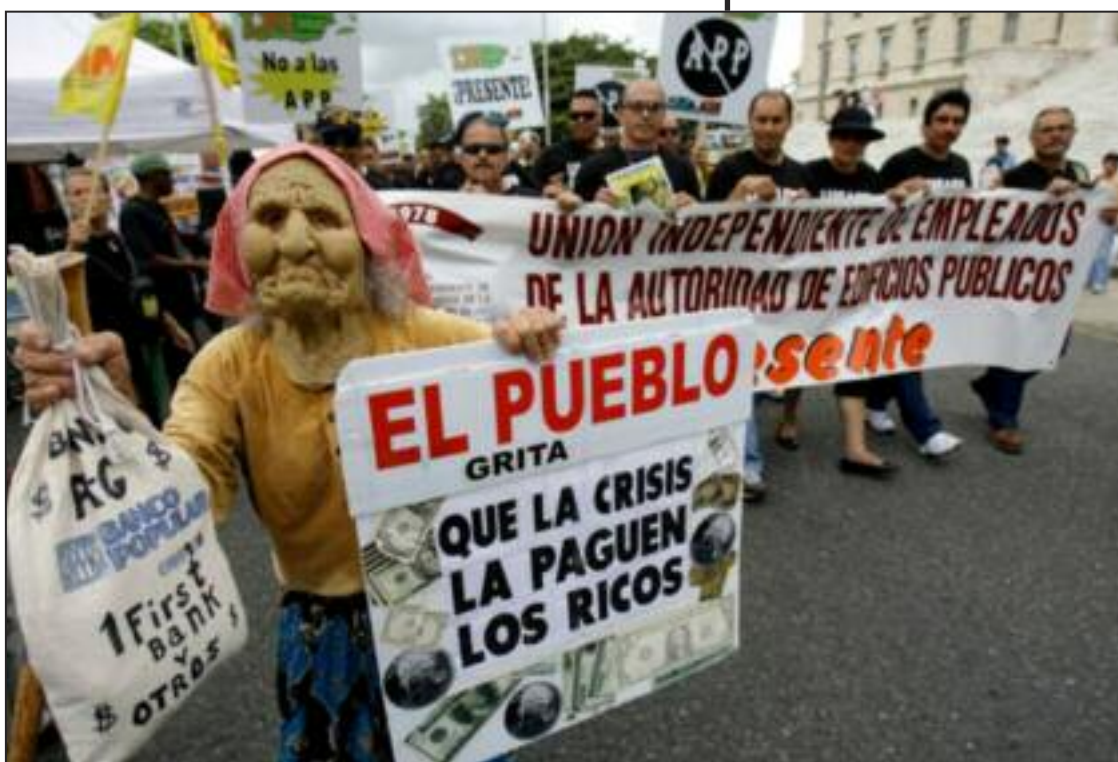
San Juan, Puerto Rico, March, 2017 The People Shout: “Let the Rich Pay for the Crisis!”

Neither independence, statehood or trade unionism will solve the problems created by capitalism. Workers and soldiers must fight for communism. That potential scares the ruling class. Their fear helps explain the US bosses' decision to send 17,000 soldiers to the island to stay until “all needs are met.” Although military jeeps and helicopters could take supplies to the most remote places, they are concentrated in the cities to