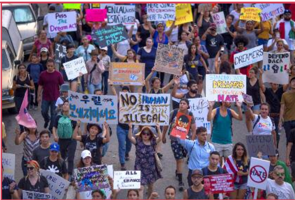
Los Angeles, USA, September 2017—March to support immigrants and refugees

He wanted to know more. We visited the website. He read some articles from the Red Flag and I told him I was going to give him more Red Flags , MMC (Mobilize the Masses for Communism) and other literature when we meet again for another workshop. His enthusiasm just shows that more people need our communist ideas. They are sick and tired of capitalism!