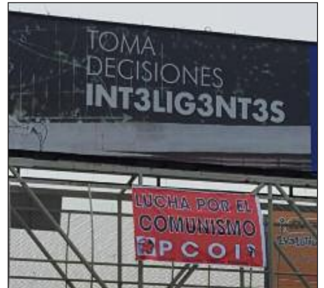
May Day, El Salvador, 2017 “Make Intelligent Decisions” “Fight for Communism—ICWP”

The evening ended by touching on a national political issue. They talked about Nayib Bukele, a young politician, ex-fmln, current mayor of the capital, who has become popular in El Salvador. Many want to talk about him because the current electoral parties have no solution to the capitalist crisis. Many are so thirsty for leadership that they have put their faith in this young man who has been the mayor and who will try to be Pres-