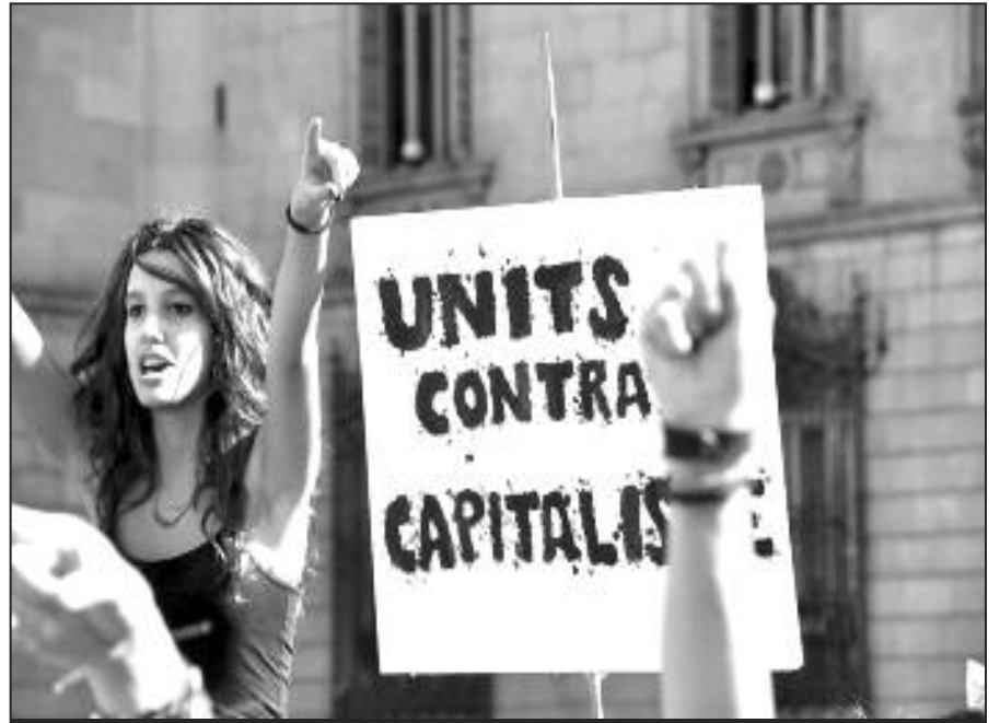
Barcelona Protest, October 2012 Unite Against Capitalism! (In Catalan)

Some of the participants in the social media said that we need peace and not resentment and