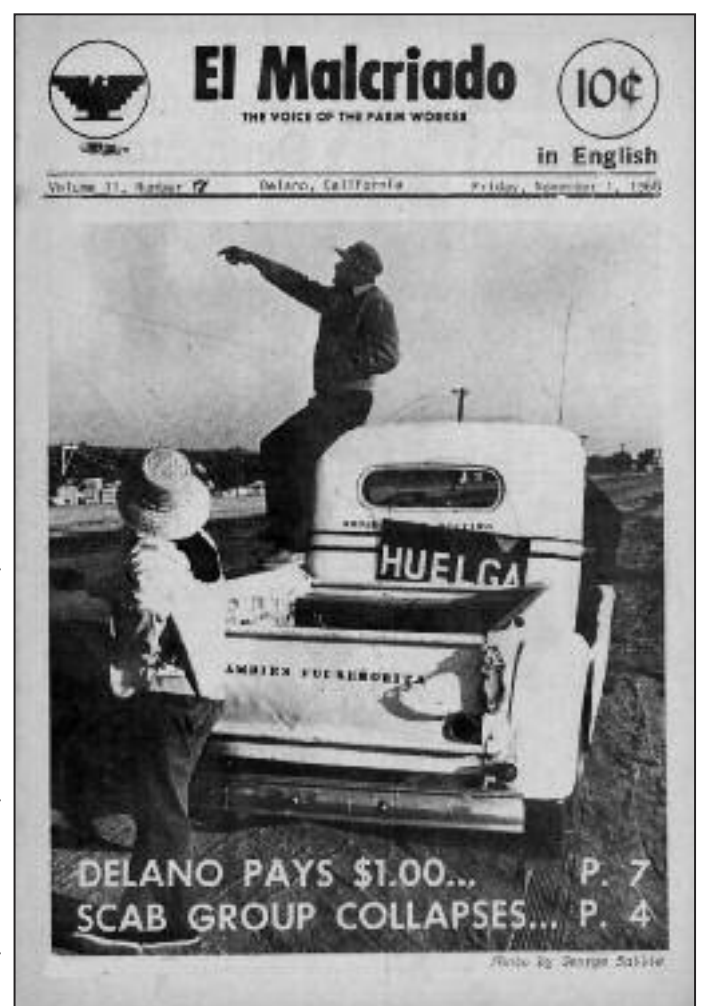
The writer of this article is the person on top of the truck giving a speech during the 1965 grape strike in the San Joaquin Valley.

“It doesn’t matter in the least which party is in power and what president holds the reins of the administration. We are not politicians nor public thinkers; we are the rich; we are the owners of the United States; we obtained it God knows how, but we intend to keep it, throwing all the tremendous weight of our support, our influence, our money, our political connections, our bought-and-paid-for senators, our hungry deputies, our demagogues who speak in public against any legislature, any political platform, any presidential campaign that threatens the integrity