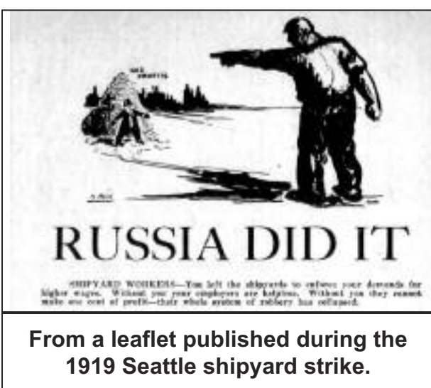
From a leaflet published during the 1919 Seattle shipyard strike.

And we must see even more clearly that it’s not enough to resist capitalism or try to roll back its attacks. We have to wipe capitalism out forever with communist revolution.