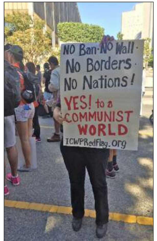
Los Angeles, USA October 15, 2017 Sign in the march protesting the 3rd version of Trump's Muslim Ban