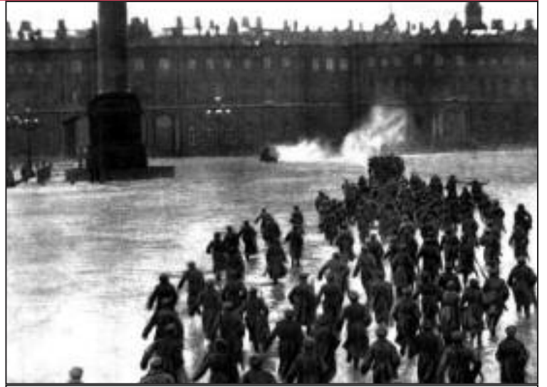
Red Guards storm the Winter Palace, October 25, 1917

Kerensky’s Provisional Government tried to reassert its control. But most troops – like the