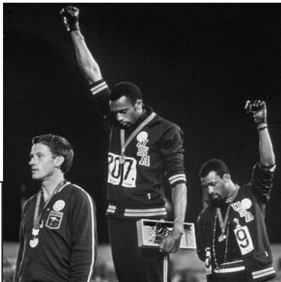
Mexico City Olympics, 1968: US athletes Tommie Smith and John Carlos, and Australian Peter Norman join the Olympic Project for Human Rights protest against racism and poverty during the playing of the US national anthem.