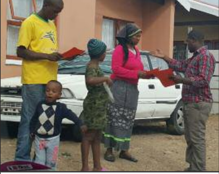
Mobilizing for Communism in South Africa Spring 2017

This is the newspaper of the working class. Obviously, we get no economic support from the capitalists, their foundations or NGOs. Please contribute generously to help cover the costs of production and distribution. Thank you.