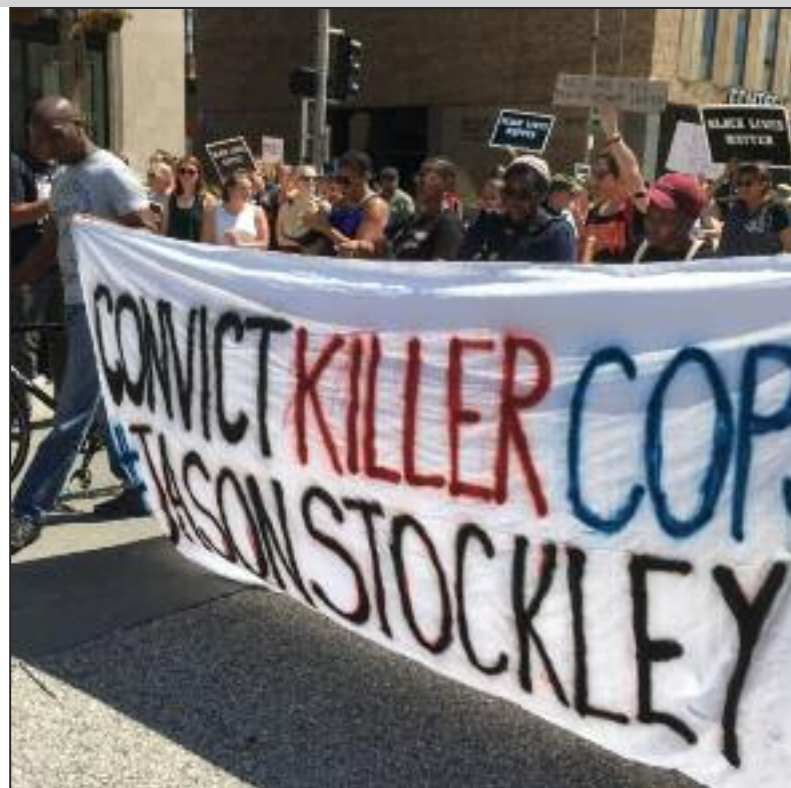
Street protests in St. Louis, Missouri, USA, September, 2017

The fight against racist police terror must attack the cause—capitalism. The rulers will never stop terrorizing and killing us. We have to get rid of them and their system and fight for a communist future which can fi-