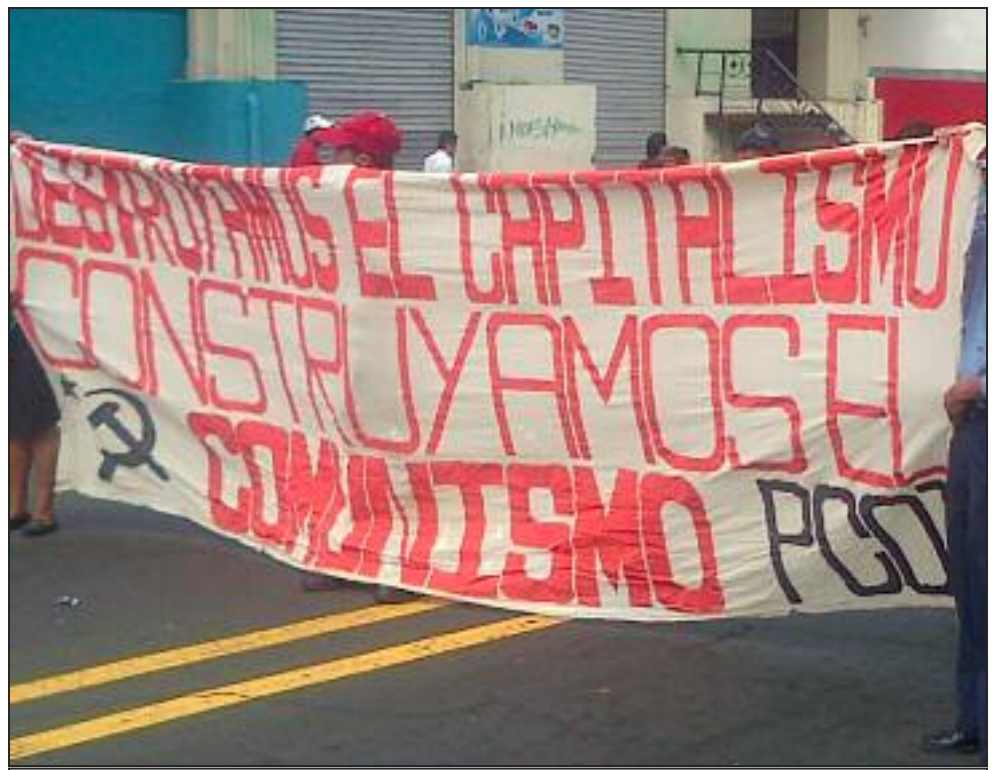
May Day, San Salvador, 2014 Let's Destroy Capitalism & Build Communism—ICWP

The working class has experienced revolutionary processes of change throughout the world. These have taught us great lessons to build the organization of the working class that will achieve the elimination of the material base of capitalism, and build a communist society. Theoretical material has been produced to learn about and understand these processes more deeply.