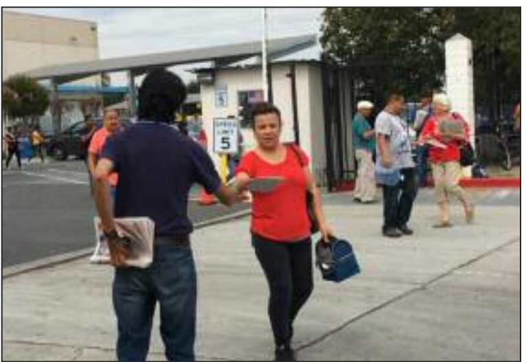
Garment workers taking Red Flag

worldwide must fight for this world without the chains of wages. An important step is to join ICWP and participate in study groups and the distribution of our newspaper Red Flag. Join now.