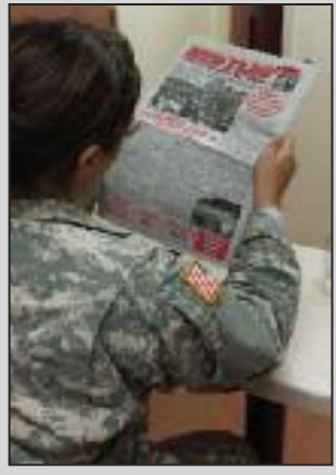
Available at icwpredflag.org/MIL/mpe.html

racism. The important point is how and why we do this.