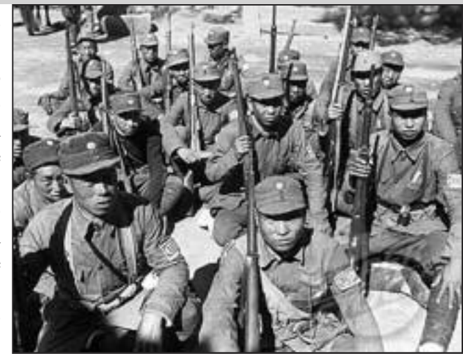
Today's Chinese imperialist rulers hide behind the revolutionary communist legacy of these Red Army soldiers.

US imperialism has declined steadily but dramatically since the Vietnam War. Two major oil wars in Iraq have strengthened the Chinese, Russian and Iranian capitalists. Even the Saudi rulers, once a solid US ally, are now deeply divided amidst Chinese and Russian pressures to abandon the US dollar.