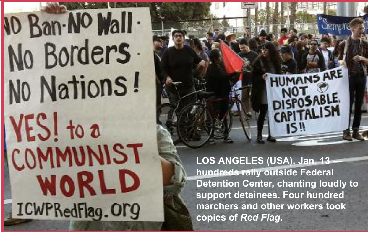
LOS ANGELES (USA), Jan. 13 — hundreds rally outside Federal Detention Center, chanting loudly to support detainees. Four hundred marchers and other workers took copies of Red Flag .