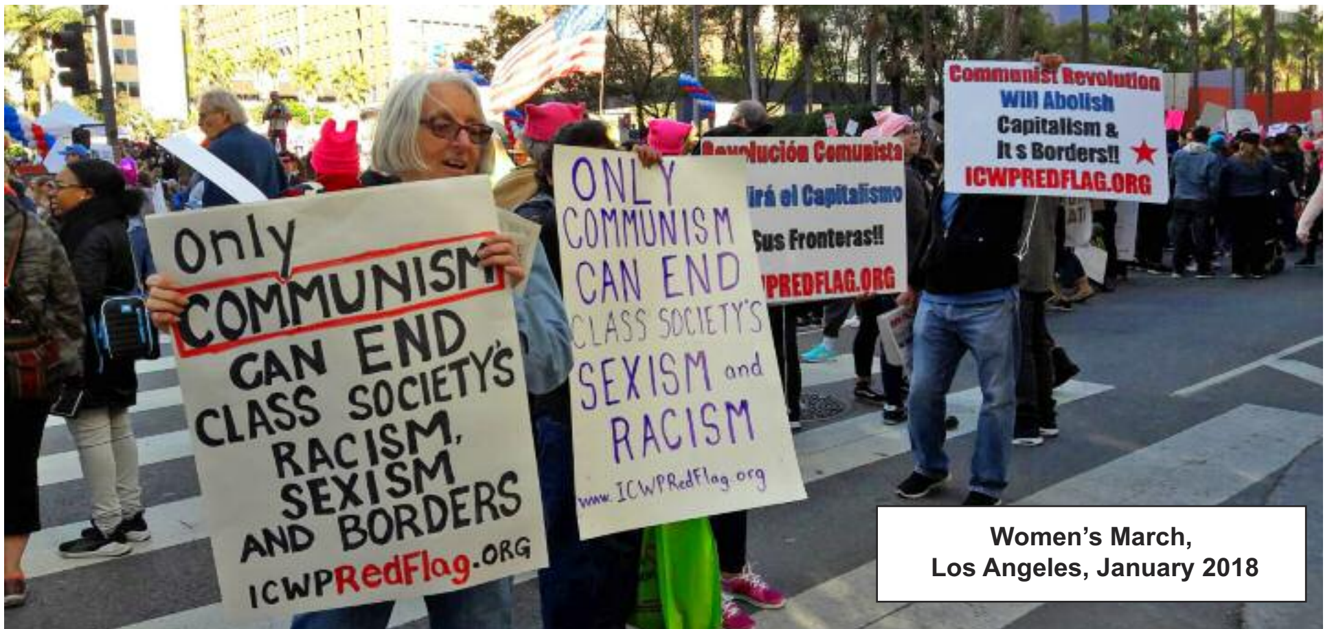
Women's March, Los Angeles, January 2018