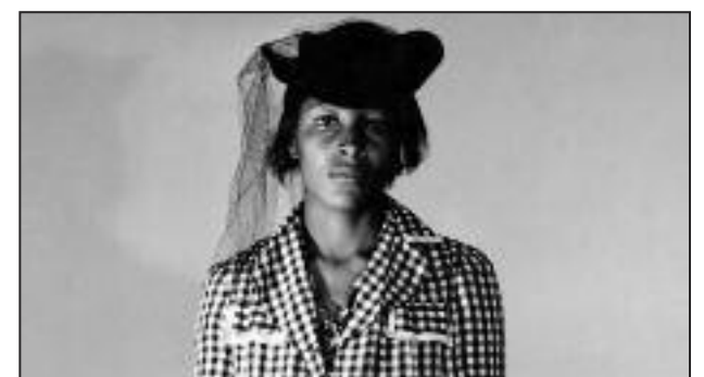
Recy Taylor, 1944

Male communists must give leadership to other men in fighting sexism. Men must see women as comrades and not just objects of sexual pleasure and the caregivers of children. Women play a leading role in our party, and will play an important role in maintaining a society run by the working class. We know that you can't votesomeone into office and expect one woman or man to do what takes the collective struggle of men and women. Only when working-class men and women make this breakthrough to understand that elected officials, whether men or women, don't have our best interest at heart, can we truly live in a society where both men and women can live and work with each other as equals. That world is a communist one and we all need to fight for nothing less.