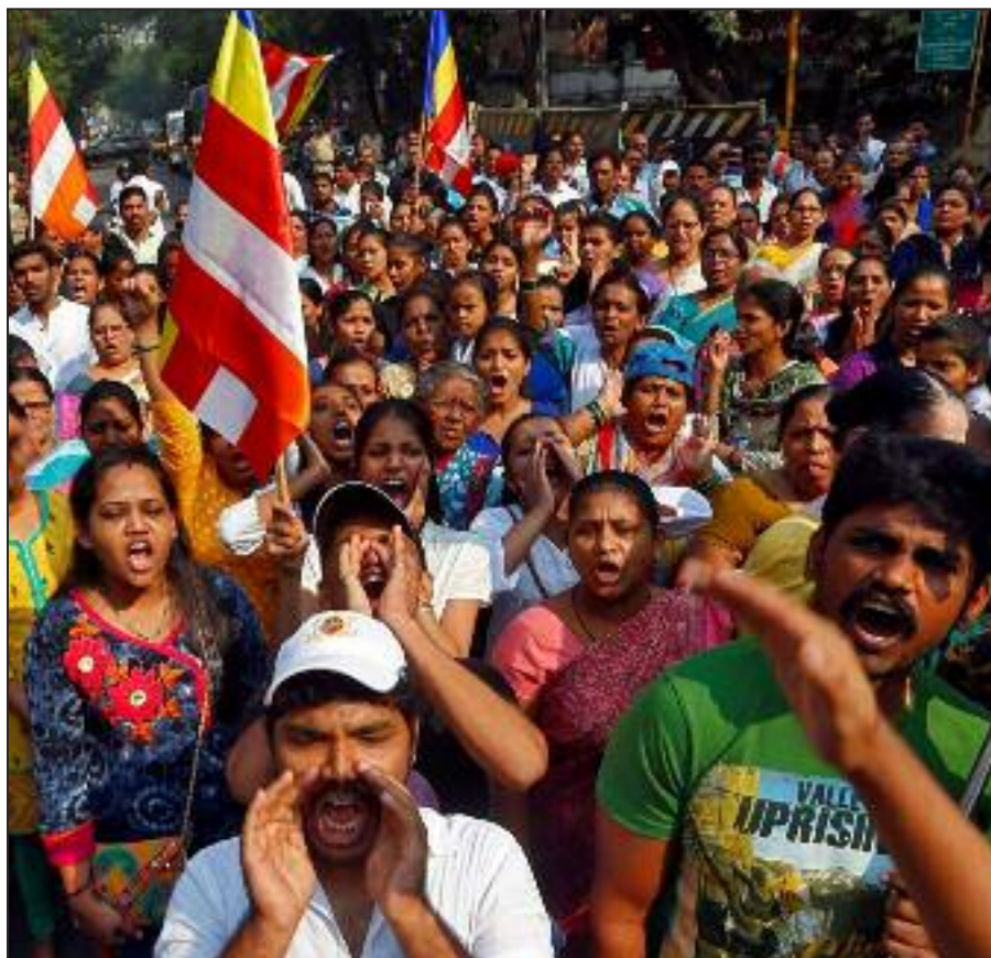
Mass protests against attacks on Dalits Mumbai, India, January 2018

Our modest efforts have shown that if we continue our work with consistency and determination, building very close ties with the working class, our party will grow quickly. Capitalism is in deep crisis. It is a weak system and it is in decline. Our party is the future. Join ICWP now and start building communist collectives!