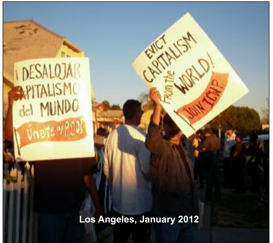
Los Angeles, January 2012

Communities created by capitalist racism and segregation have developed neighborhood structures for survival. As finance capital sees an opportunity to make money by gentrifying these