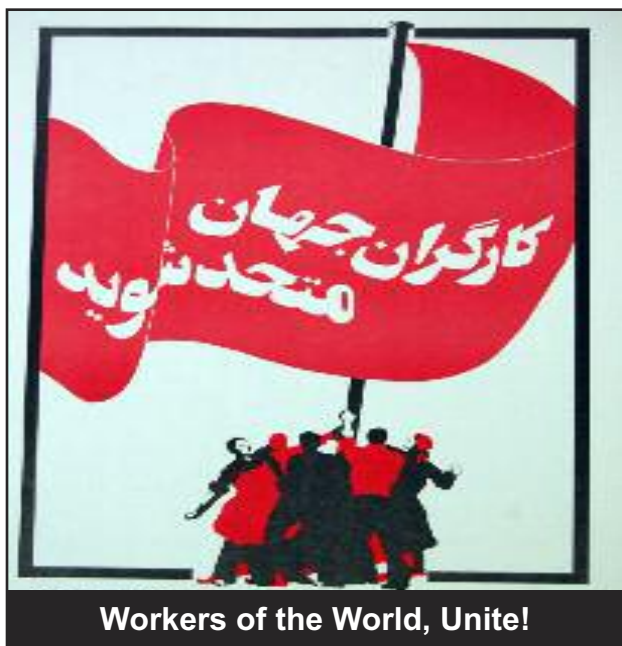
Workers of the World, Unite!

Communist relations of production produce communist organizers above all else. Developing such organizers is our prime responsibility now—and in the future.