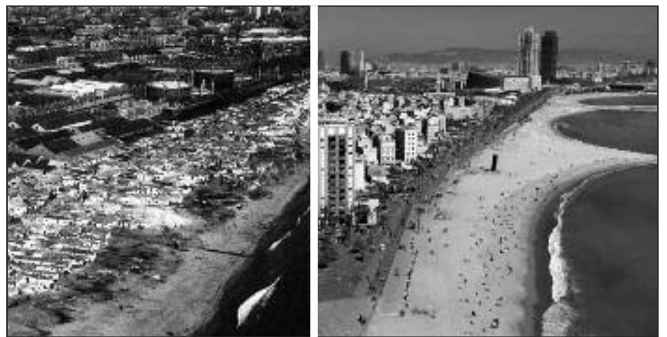
The Barceloneta Left: in the 1960s; Right: in the 1990s

We have to build a society where the workers do not have to commit suicide or live outside because they don’t find “opportunities.” We don’t need owners of land (private property). We only