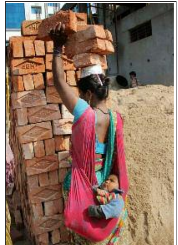
Women worker, India