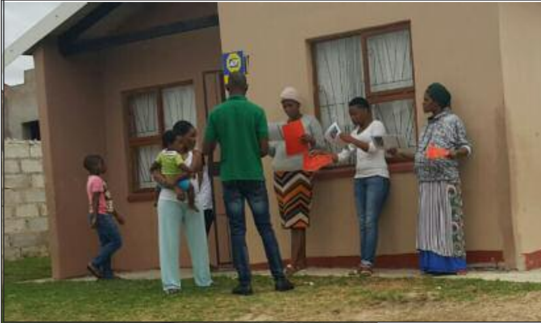
Organizing for a Communist May Day, 2017, South Africa

better living conditions, the end of exploitation, demolishing of borders and certainly putting an end to capitalism. It simply means that the power is shifting towards the western imperialists to put into motion their plans. Their plans are to exploit the working class of South Africa and even kill anyone who is in their way as they did in Marikana in 2012.