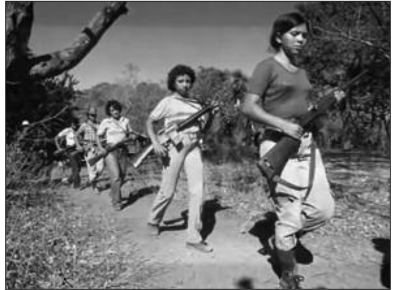
Women guerrilla fighters, El Salvador