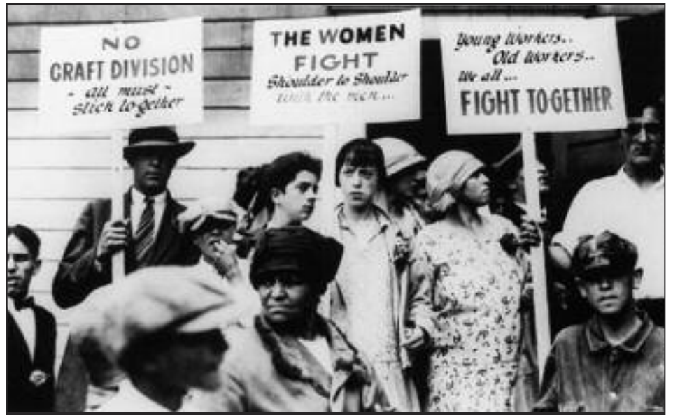
Textile workers on strike in 1928, New Bedford, Massachusetts, USA

We fight for the international working-class unity of immigrants and citizens that we need to wipe out capitalist exploitation once and for all. Our slogan is "Fight for a Communist World without Racism, Sexism, Borders, and Wage Slavery!"