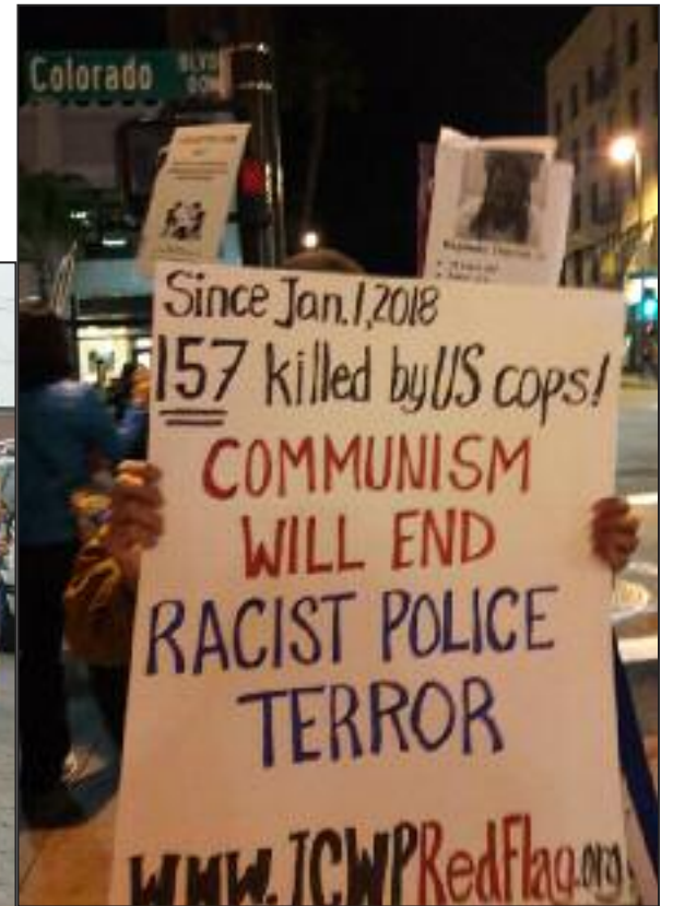
PASADENA (USA), Feb. 16—ICWP comrades join a protest against racist police brutality and murder.