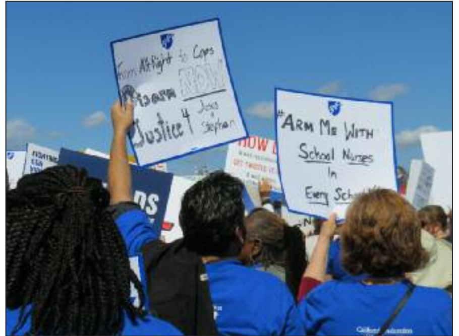
School workers in “March for Our Lives”

That “something” is open mass mobilization for communism. We need to find more ways to build long-term ties with those who will, maybe sooner than we think, join us.