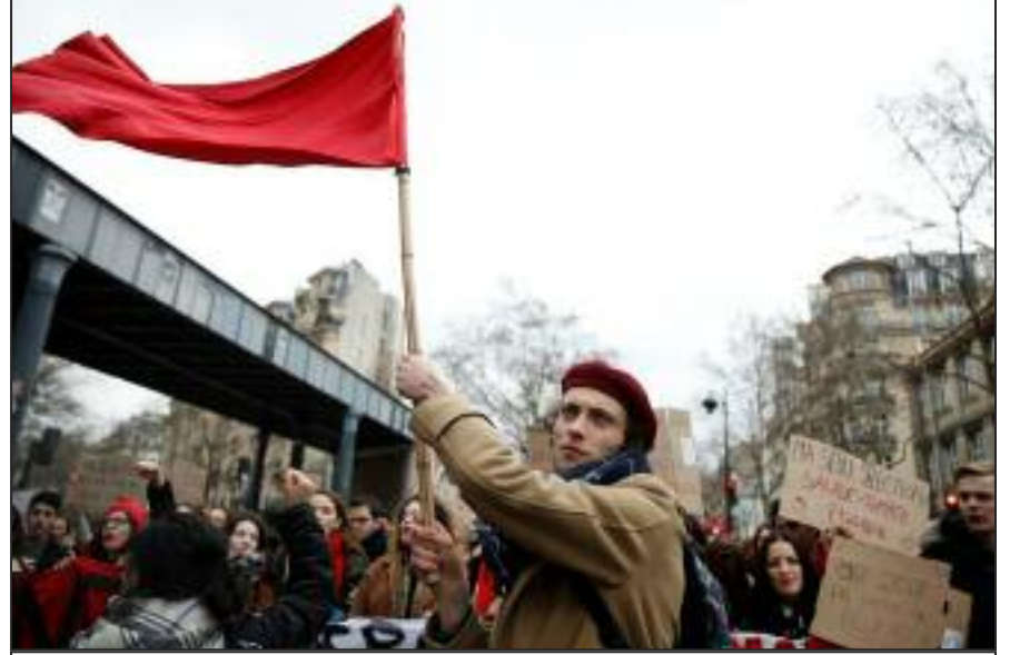
PARIS, March 29 — Tens of thousands of workers, teachers and students flood the streets in solidarity with rail workers who are disrupting France with intermittent strikes. They are protesting changes proposed by President Macron to the rail system, university admissions, and to unemployment and pension benefits. Rail workers in the United Kingdom have also walked out.

The communards held the French army at bay for two months, fighting battles every day. Fi-