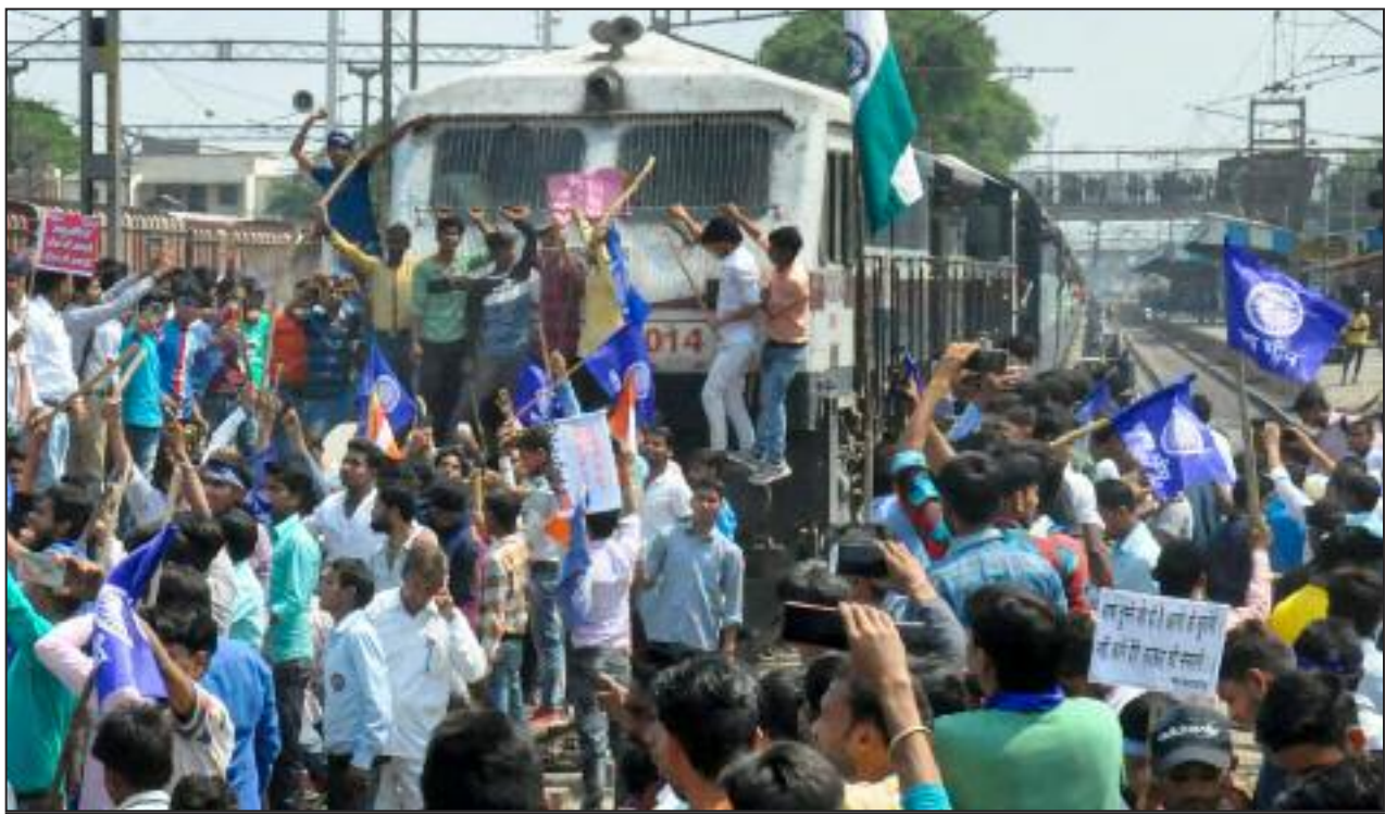
April 1: Angry masses stop trains during Bharat Bandh

Tens of thousands of youth mostly in Northern Indian states, armed themselves with sticks, stones and petrol bombs in anticipation of state violence. Police stations, trains, public transportation, district courts burnt as in many cases police were outnumbered. Police couldn't contain the growing violence. The military was de-