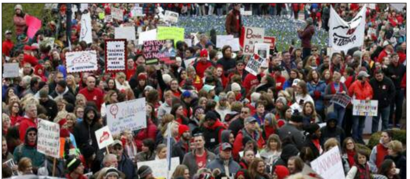
USA, April 2—Inspired by the recent West Virginia school strike, teachers walked out in Kentucky (above) and Oklahoma.