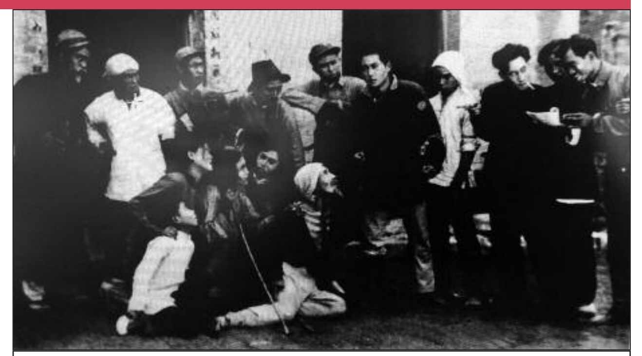
The Taihang Mountains Drama Group performing "A Hatred of Blood and Tears"

"Behind them came the musicians with their drums, cymbals, gongs, and pipes. Next came the