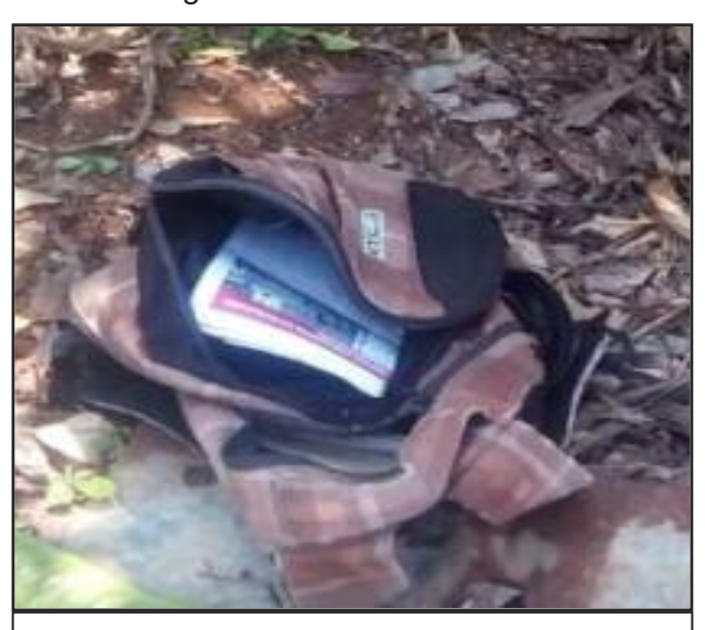
Red Flag in the mountains in the south of Mexico