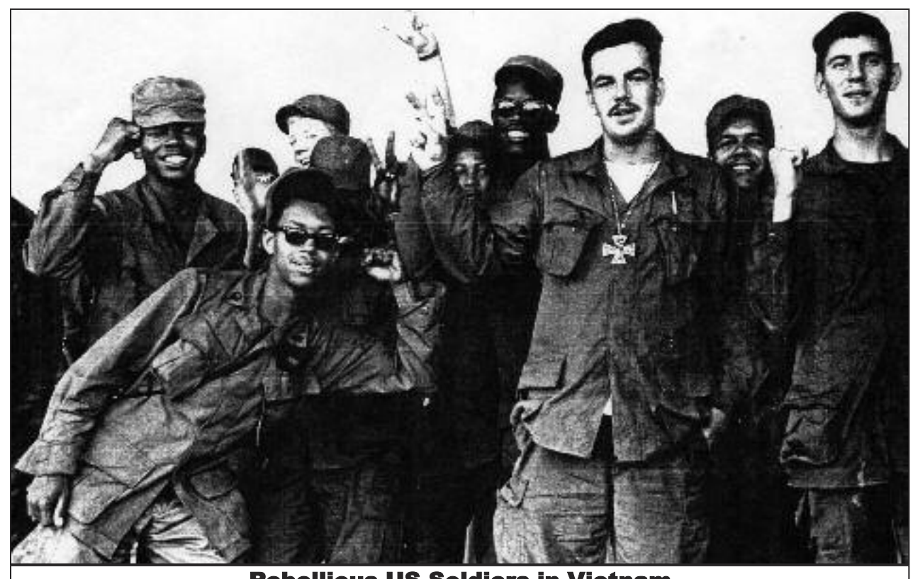
Rebellious US Soldiers in Vietnam

The main lesson is: Communist revolution is possible. When the revolution comes, it will be because we have prepared to make it happen.