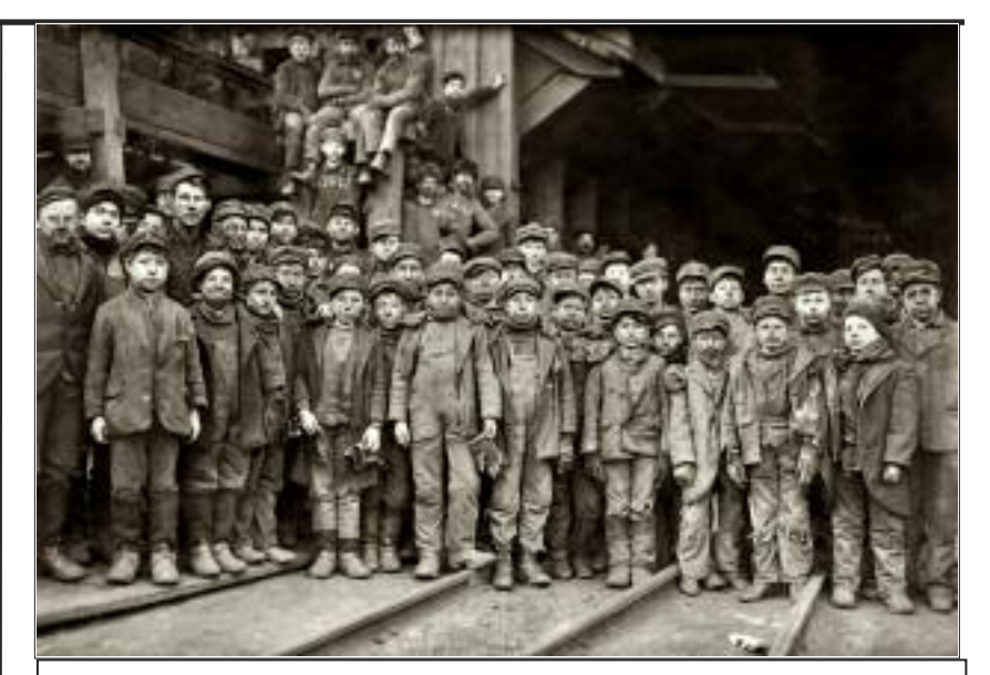
Breaker Boys—Pennsylvania Coal Company's mine in South Pittston 1910

In communism, we will combine learning and age-appropriate practical work from an early age in nurturing, healthy collectives. Work will be fun and inspire confidence and collectivity.