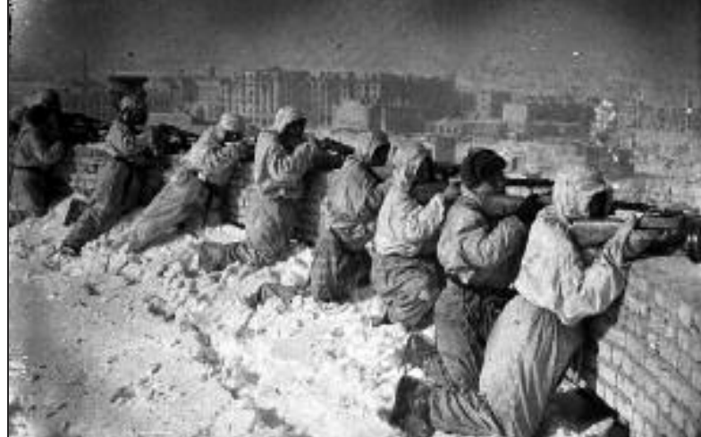
Red Army soldiers and communist-led civilians smashed the fascist Nazi army at Stalingrad, 1943.

AS WE GO TO PRESS: June 26—The U.S. Supreme Court has upheld Trump's Muslim Travel Ban 3.0. This racist attack on Muslims and all workers is consistent with other sharp fascist attacks by the Supreme Court this session. Only communist revolution can defeat fascism.