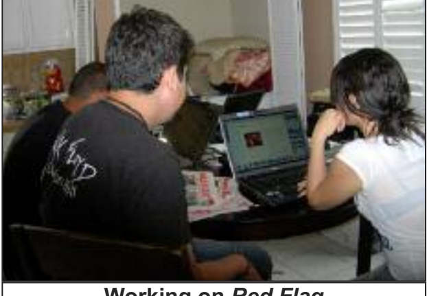
Working on Red Flag

When we say "Join us!" this is what we're talking about.