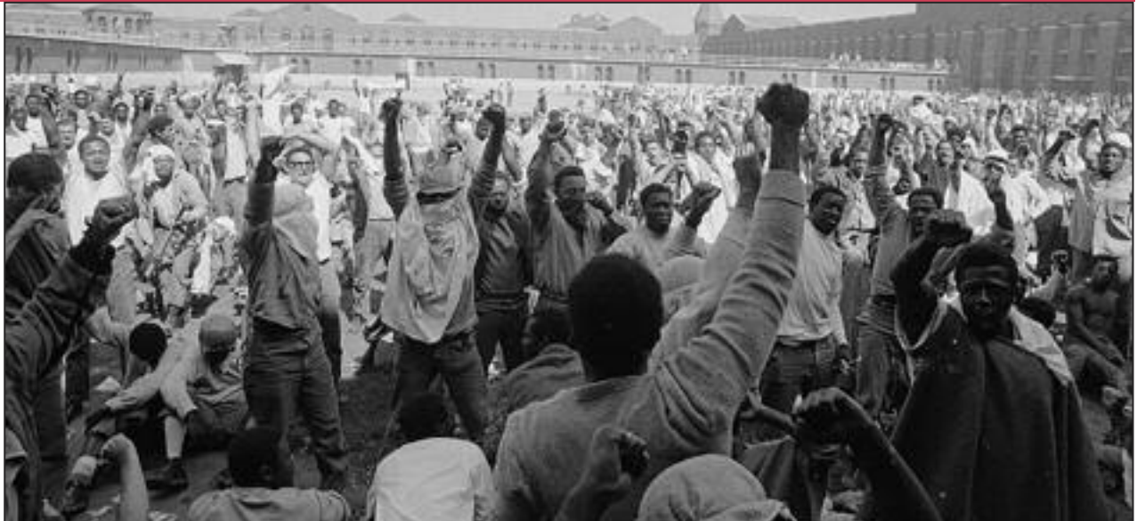
Attica Prison uprising, 1971

Prisons reflect capitalism’s need to violently impose the rule of the tiny capitalist class on the vast majority—the working class. While the capitalists—the real criminals—walk free, jails and