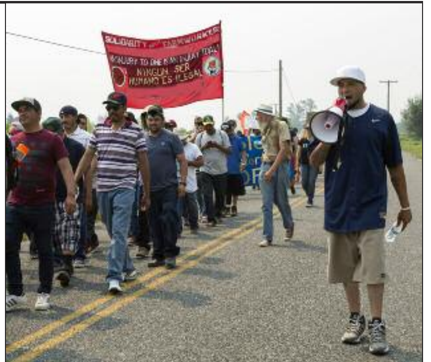
Farmworkers strike in Sumas, Washington, August 2017 More pictures on the blog: icwpweb.wordpress.com

He knew communist healthcare was the solution, not Medicare for All. “But, we aren’t there yet,” was his final argument. We’d be a lot closer if he joined the party.