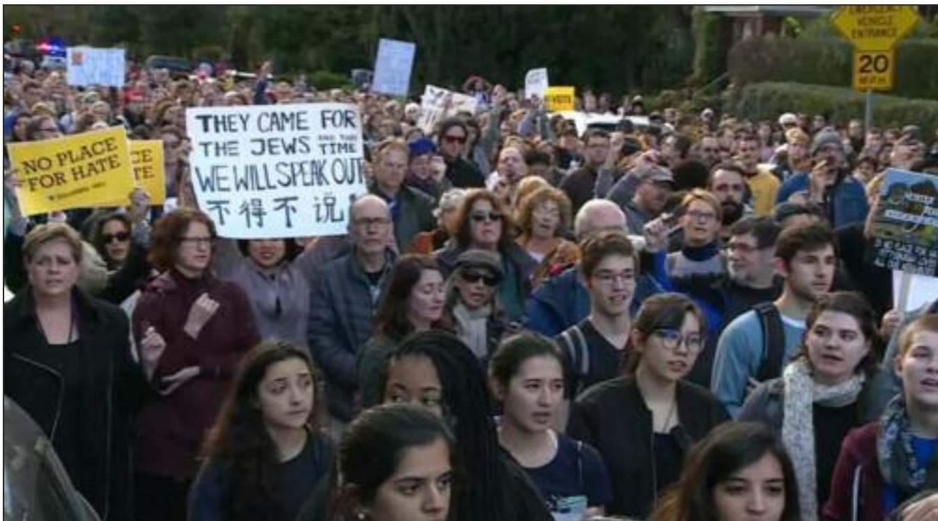
Pittsburgh, USA, October 30, 2019

We need to build a new Red Army , led by communist industrial workers, soldiers and youth. We need to build the International Communist Workers’ Party to mobilize for communist revolution – the only way to defeat fascism and imperialist war.