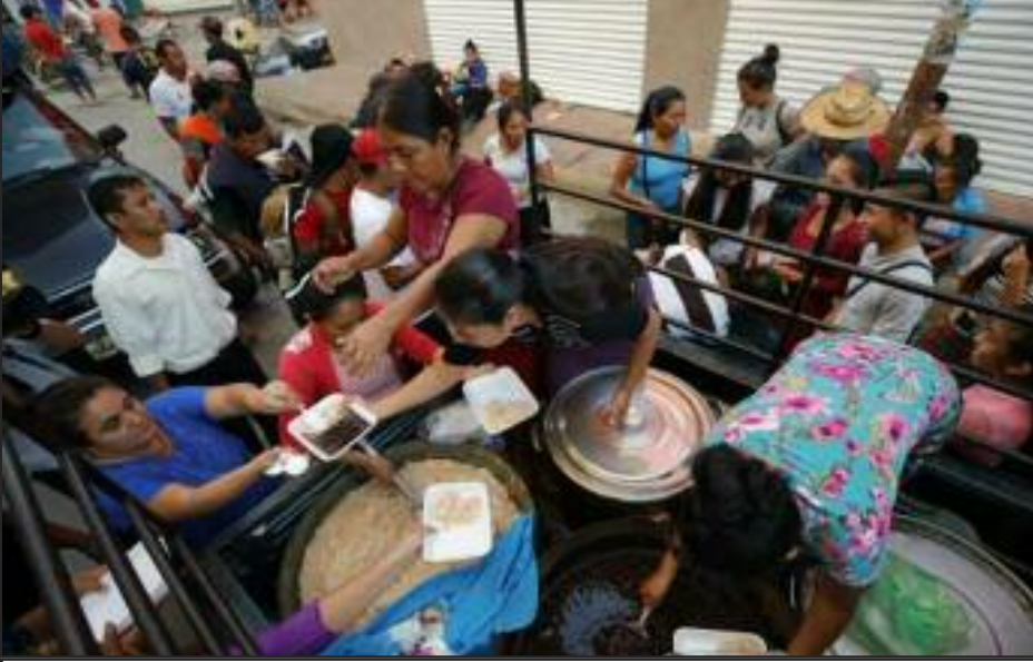
Solidarity: Mexican women workers feeding Central American migrants in the caravan