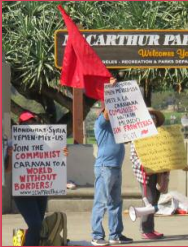
SOLIDARITY WITH MIGRANT AND REFUGEE WORKERS: (Left) Los Angeles, USA—see page 2 (Below) Berlin, GERMANY—see page 5

THE INTERNATIONAL COMMUNIST WORKERS' PARTY * WWW.ICWPREDFLAG.ORG