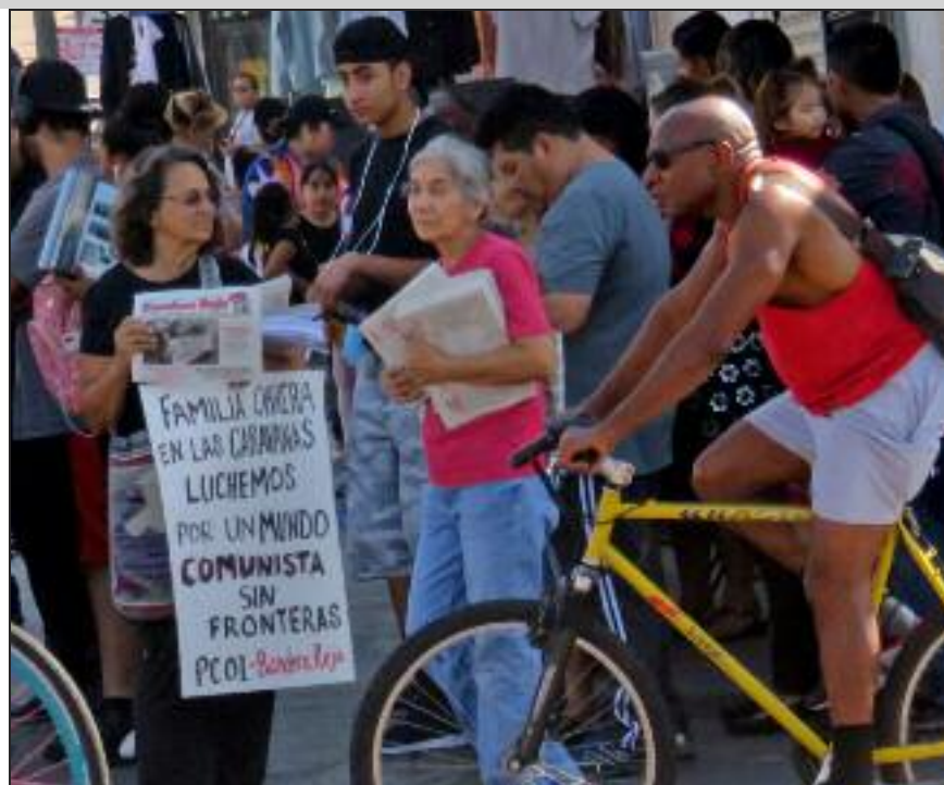
“Working-class family in the caravans” “Let’s fight for a communist world without borders” ICWP Red Flag Los Angeles, USA, October 27, 2018

However, in the 1960s, these masses once again rebelled against the vile exploitation of the U.S. imperialists and local capitalists. The U.S. supported the rulers. The Russian and European imperialists, seeking to seize control of the region from the U.S., armed and financed the rebels. The