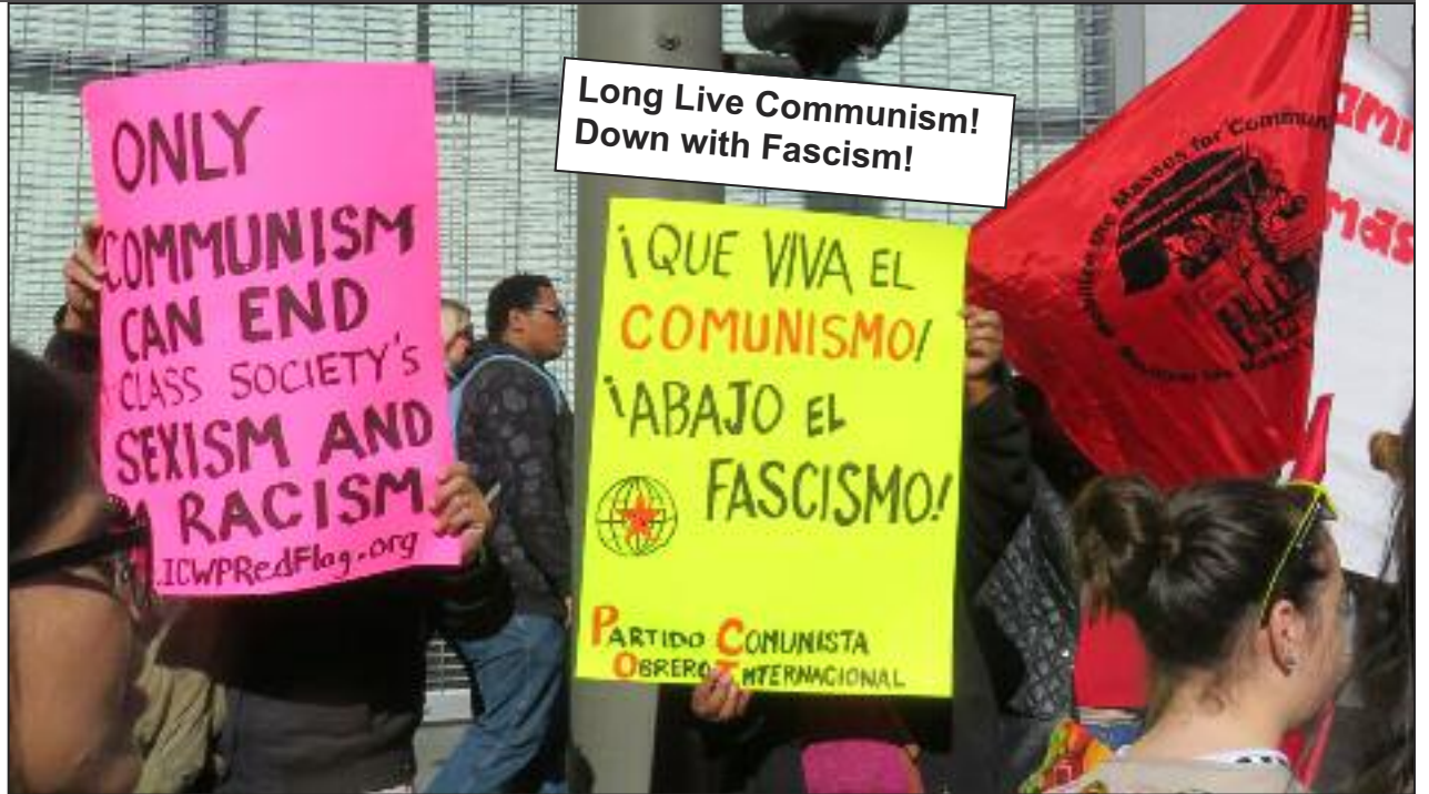
Los Angeles, January 20, 2017

Yes, post-modern feminism is subjective because its activists normally don't suffer class oppression. But it seems to me to be an error not to emphasize how all oppressions working together keep capitalism functioning. Today the proletariat that the system depends on is op-