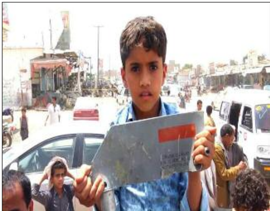
A child holds a fragment of the U.S. Lockheed Martin-made MK-82 bomb used in the August bombing of a school bus full of Yemeni schoolchildren

Once we have rid the world of capitalism, we won't fight or compete over any place, no matter what resources it has or is near. The life of each and every worker will be valued above all else. Not one drop of workers' blood for oil! Not one child starved for "strategic" geography!