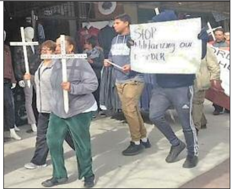
El Paso, TX, USA, Nov. 10, 2018

On November 10, there was a pro-immigrant demonstration near the US-Mexico border in El Paso, Texas. Two hundred people called for an end to the militarization of the border, solidarity with the immigrant caravans and against jailing