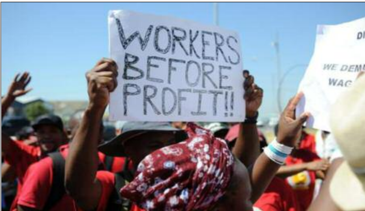
Capetown, South Africa, Nov. 18 – Dis-Chem distribution center workers on strike against a racist pharmaceutical company. In Johannesburg, police fired rubber bullets to disperse thousands of protesting strikers.

It will be done by workers themselves by organizing their society in the way that it meets their needs. Join the struggle today and prevent us from being losers in capitalist games, but instead to become winners who forge the future. We have nothing to lose but our chains.