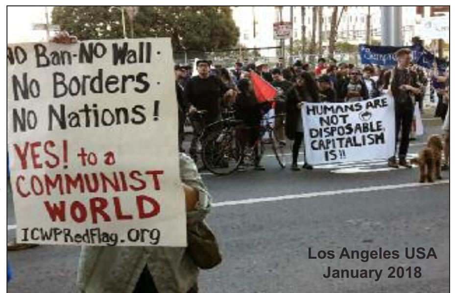
Los Angeles USA January 2018

We'll follow up on the advances we made so far. We'll do our part locally to advance the international struggle for communism. Our goal is to end this capitalist catastrophe and all the other catastrophes inherent in this system.