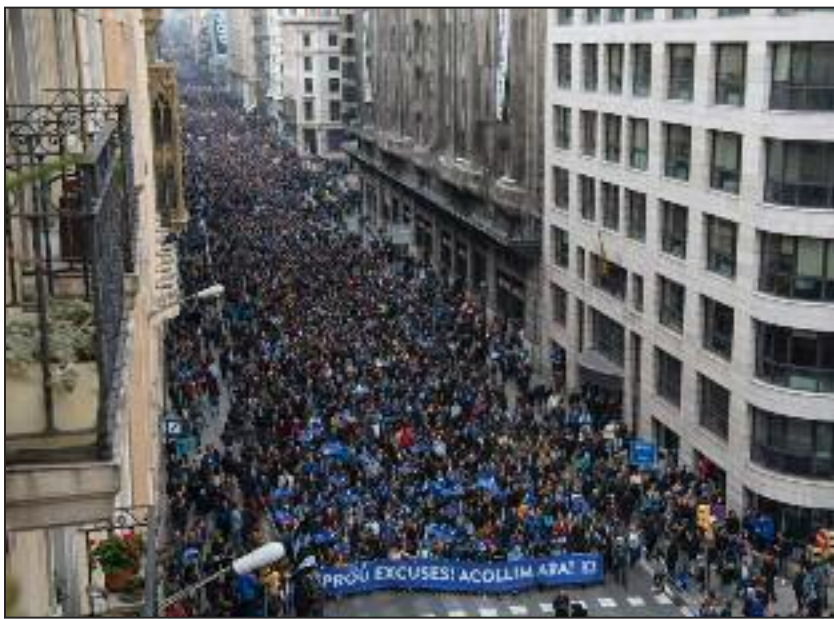
Barcelona, 2017: Demanding that the Spanish government accept more refugees

The way to put an end to the capitalist disasters causing more people to seek refuge than at any time since World War II is with communist revolution. The masses can mobilize for and win a communist world. Refugees must and will be welcomed everywhere that has been liberated. We will replace borders and nations with one communist world and one International Communist Workers' Party mobilizing the masses everywhere to spread revolution and production and distribution for need. The solidarity and sharing at the border show us the way forward.