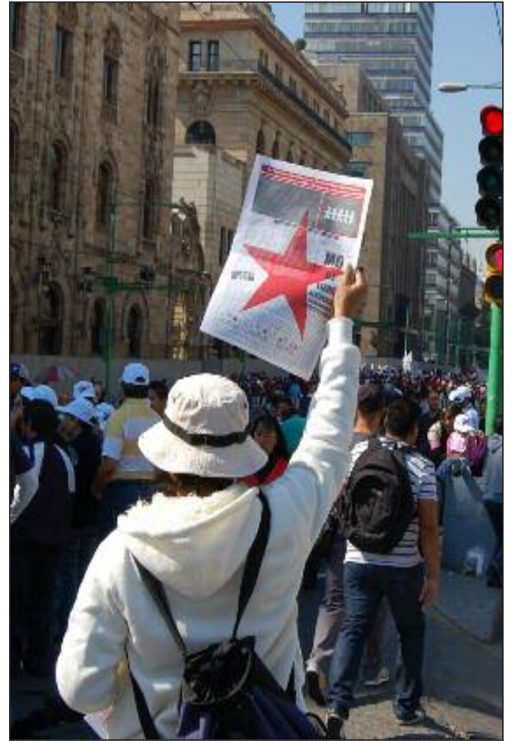
May Day, Mexico City, 2013

ities, such as passing out leaflets at the factories, to organize more people to come to our study circles and to the party. As one of the young women concluded, "For a revolution, an evolution of consciousness is needed first."