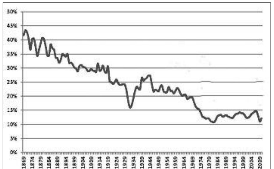
World Rate of Profit, 1869 – 2010