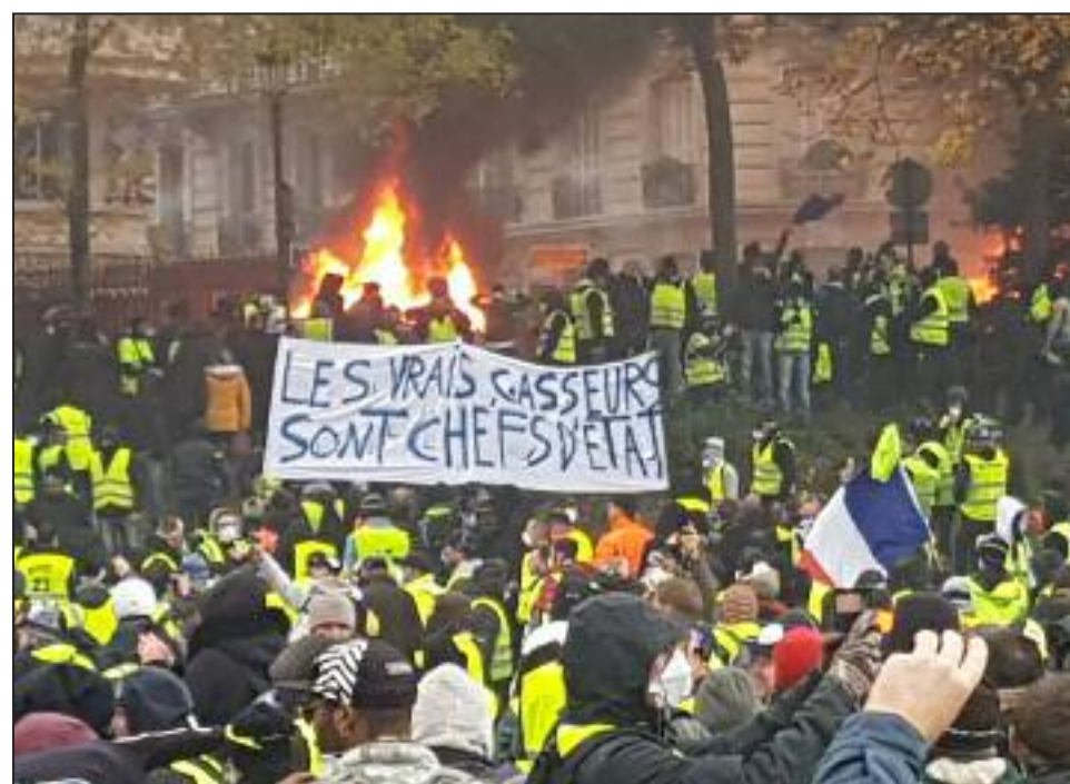
Paris: “The real vandals are the heads of state”

The communist slogan “Workers of the world, Unite! You have nothing to lose but your chains!” has never been more to the point. Together we have a communist world to win.