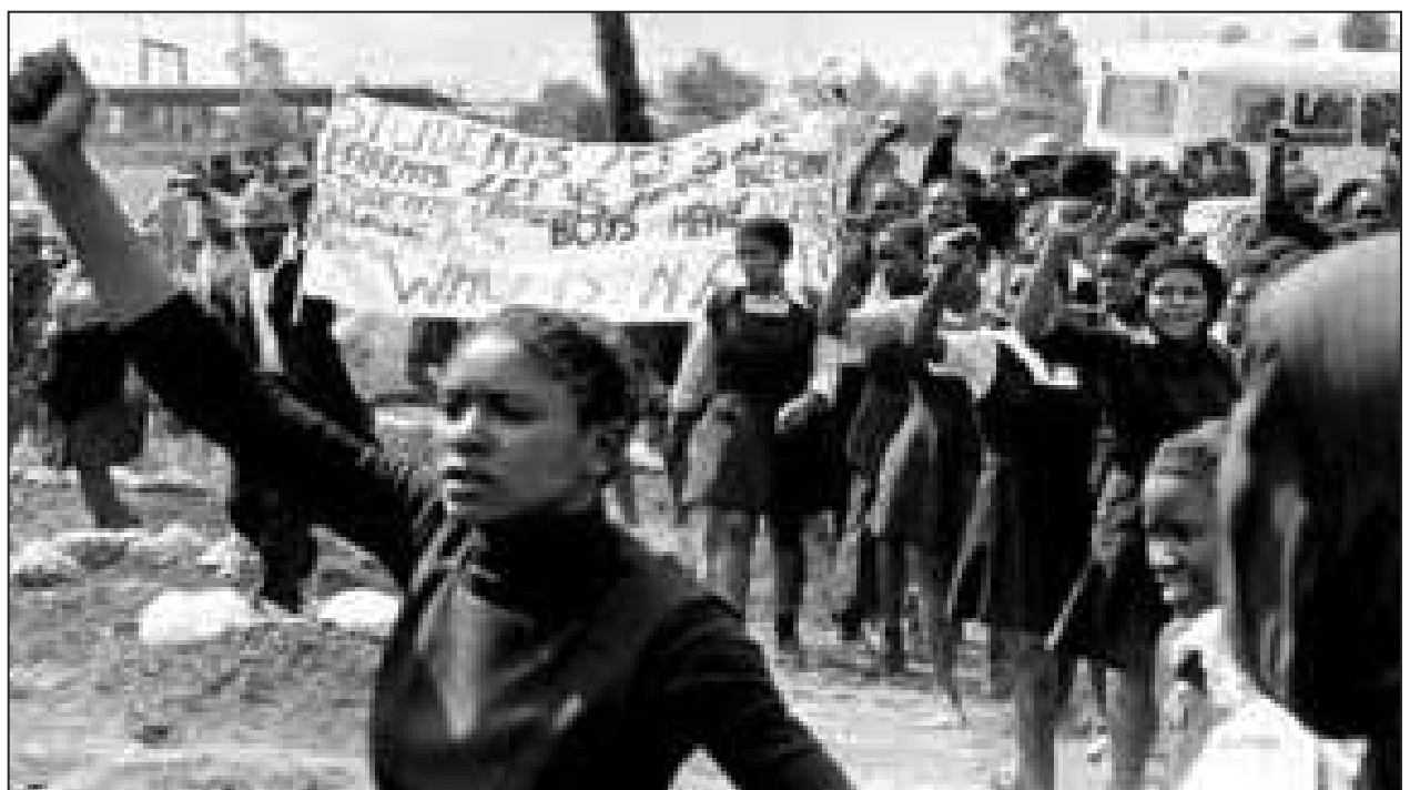
Students in Soweto, South Africa rebelled in 1976 against racist schools. They raised the slogan “Liberation before Education,” rejecting the lie that schooling creates better anti-racist fighters.

To create the conditions for that kind of education will be a long, hard road. It will require mobilizing the masses, not for capitalist reforms, but for communist revolution. It will require a mass communist party with the teachers, parents and students who are now fighting for better schools mobilizing for a communist future. We invite you to join the International Communist Workers’ Party to help fight for that world.