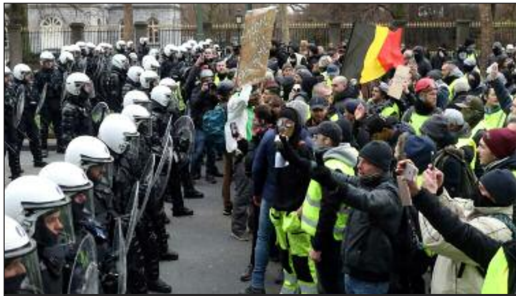
Yellow vest protests in Belgium: “No to Fascism!”

French capitalists export more agricultural