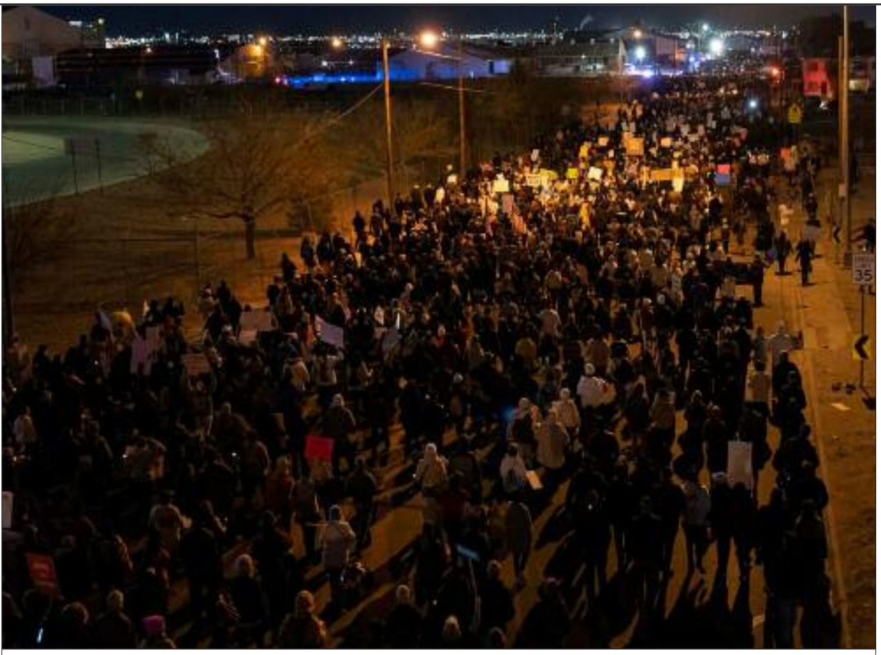
EL PASO (USA), February 6: El Paso, TX, 2/6— March and rally of ten thousand organized by groups that have been aiding immigrants for years. Democratic Party politician Beto O'Rourke stole the spotlight. He betrayed the demonstrators when he justified immigration as a way to fill the ranks of the U.S. imperialist armed forces. Soldiers and workers, native-born and immigrant, must unite to defeat imperialism with communist revolution.