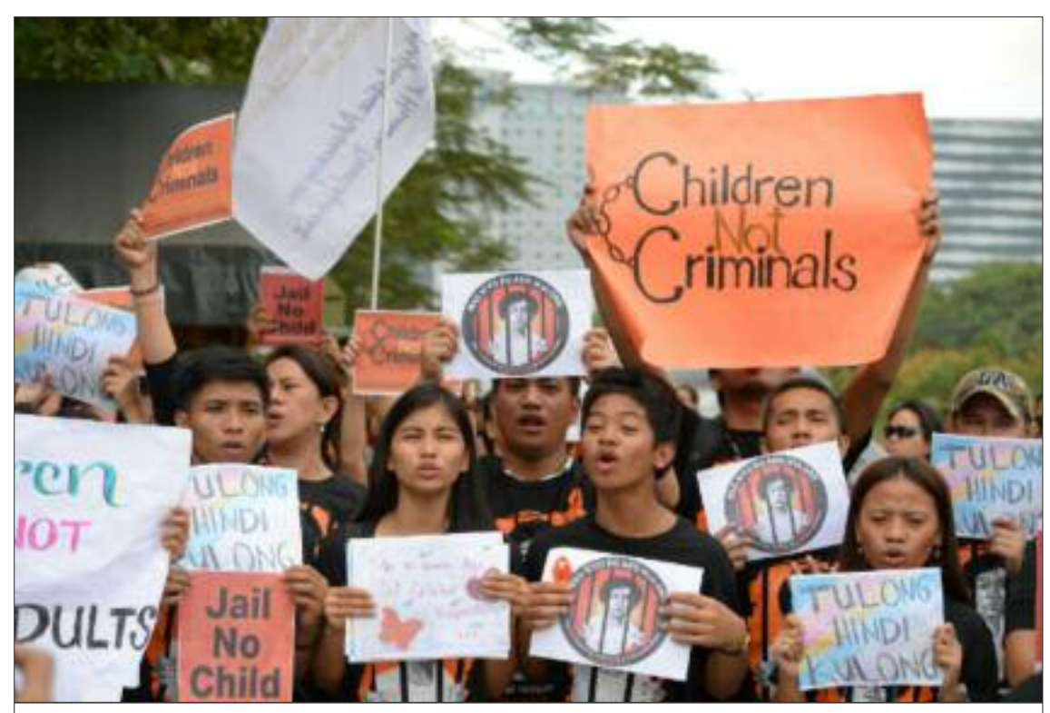
Youth in the Philippines protest Duterte's move to lower the age of criminal responsibility from 15 to 9 years old.

Spain colonized the Philippine Islands in the 1500s. Four hundred years later, Spain was a declining power and the US was on the rise. In the