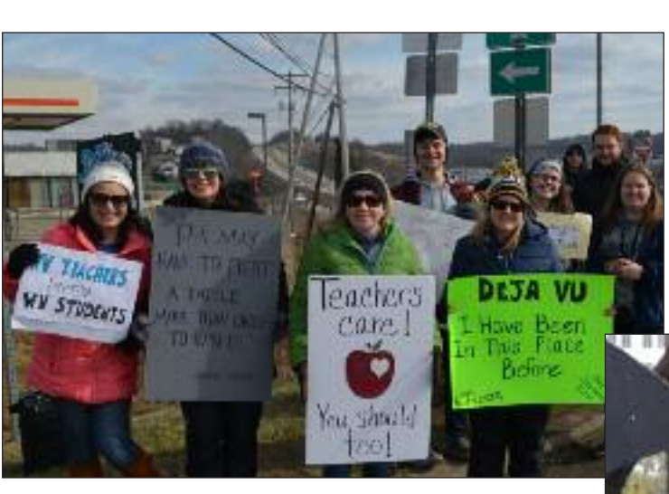
West Virgina, USA

Increasing the circulation of Red Flag will help to show that's wrong. This paper describes the class struggle raging worldwide. It shows that the masses in motion are responding to communist ideas. Communist revolution is the only way to begin to create the education – and everything else – that the working class needs.