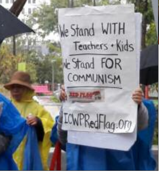
Denver, CO, USA

Feb. 20, USA—As we go to press, teachers in Oakland, CA are preparing to go on strike in the morning. They are demanding more nurses and support staff and higher pay to keep experienced teachers. They are fighting school closures and privatization. These demands reflect the crisis in the public schools after two decades of "school reform."